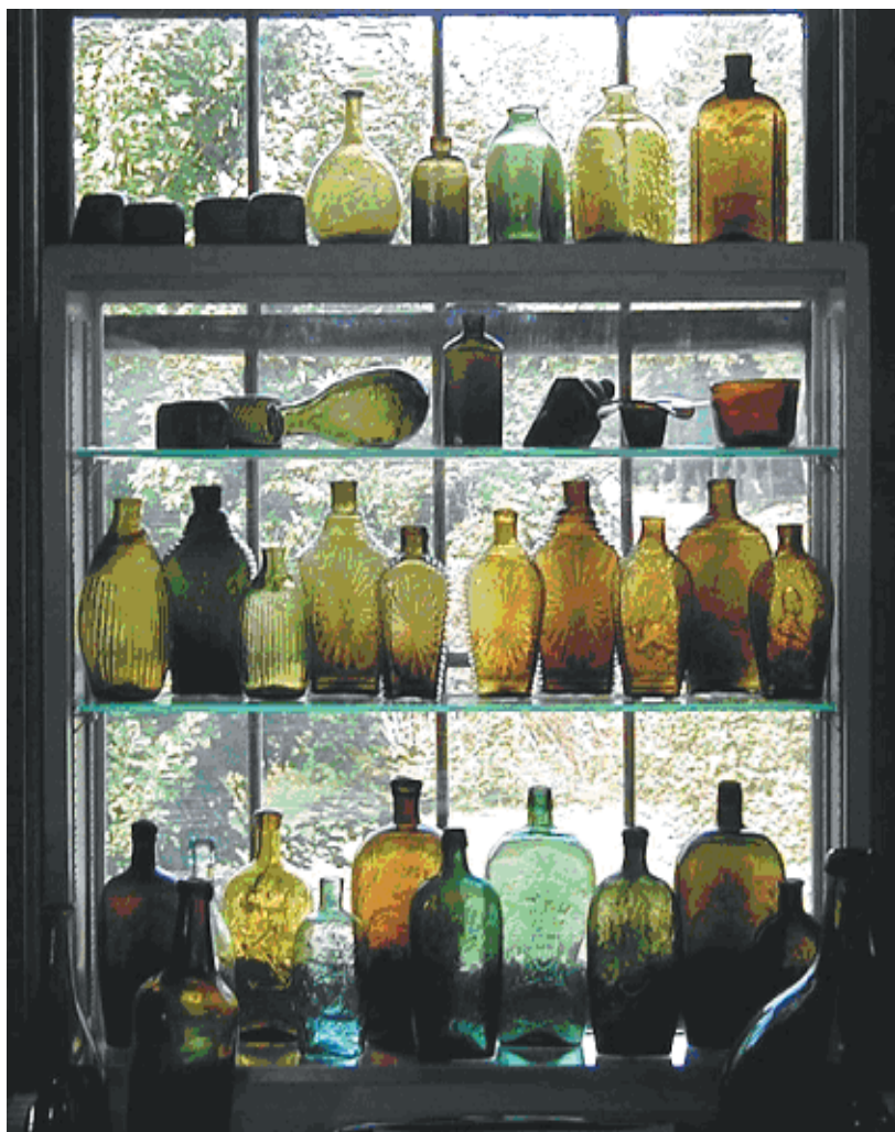
Figure 1: A fine grouping of some Connecticut glass that includes inkwells, snuffs, utilities, off-hand pieces and various flasks.