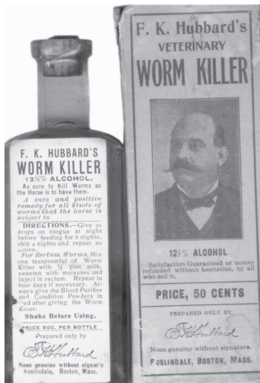
Figure 5: Later variation without the X-Rays and the addition of his image on the box. 5" label only.