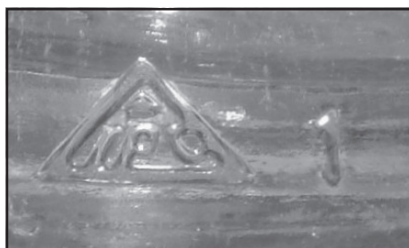
Figure 12: Triangle IPC Basemark [Lockhart]