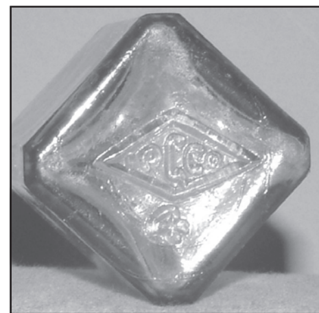
Figure 3: IPGCO in a Diamond [Lockhart]

The mark was also used on jars. Colorless Boyd Mason jars with continuous-thread finishes were embossed I. P. G. Co. in a diamond on the base during the 1910-1920s period. A variation had the I. P. G. Co. on the heel. A version of the IMPROVED Everlasting JAR also was embossed with IPGCo in a diamond on the base as was the SEALTITE WIDE MOUTH MASON (Creswick 1987:121; Roller