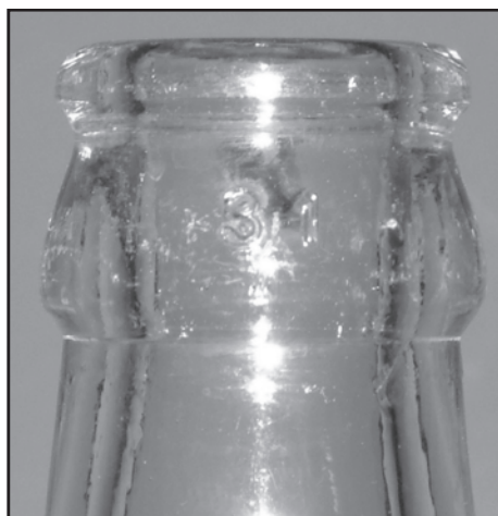
Figure 13: Date Code on Crown