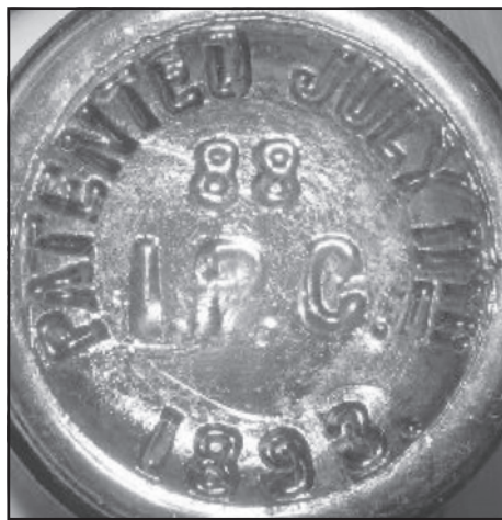
Figure 14: Imperial Packing Co. [eBay]