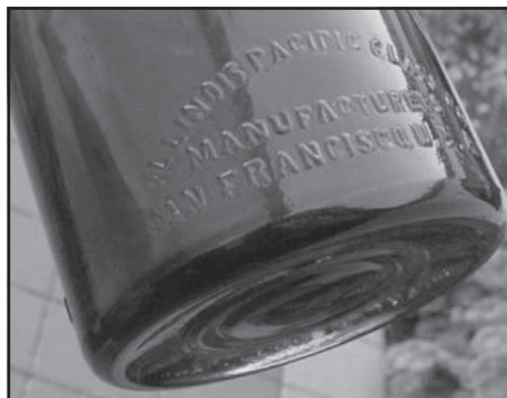
Figure 7: Illinois Pacific Bottles Exported to New Zealand [Crouch]

Creswick (1987:52) also described a second version of the IMPROVED EVERLASTING JAR that was marked on the base with "I. P. G. Co. S. F. Cal. (within a triangle)" (her parentheses). Unfortunately, she did not illustrate the base of this jar. If she is correct, it would be the only recorded instance of the letters I P G Co in a triangle. I suspect it is more likely that she meant the initials were in a diamond with the city/state designation around the edges. Roller (1983:164) described the jar as "IPGCO S F CAL in diamond logo embossed on base" (note there are no periods in the Roller version).