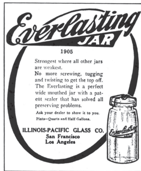
Figure 6: Ad for Everlasting Jar [Creswick 1987:195]