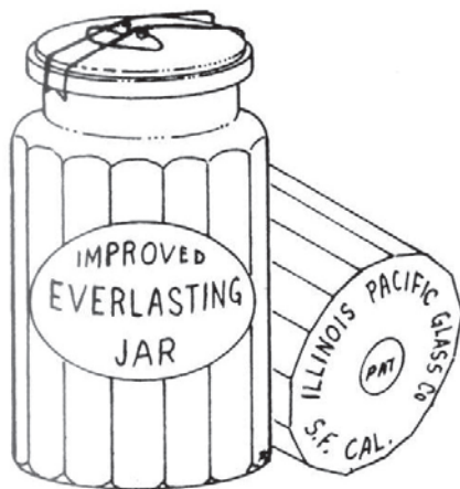
Figure 5: Improved Everlasting Jar [Creswick 1987:52]