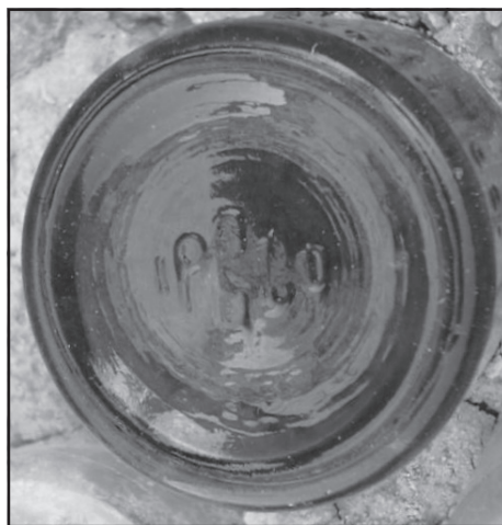
Figure 2: IPGCO Basemark [Lindsey]

We found one interesting bottle that was embossed with I. P. G. Co. on the heel and IPGCO-in-a-diamond on the base (ca.