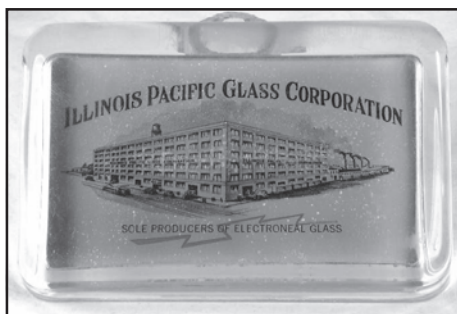
Figure 10: Electroneal Paperweight [Lindsey]

On bottles that should be from 1926, there are no identifiable date codes. However, the number "7" appeared in one of the formats described above (usually the number to the left) on all bottles that can