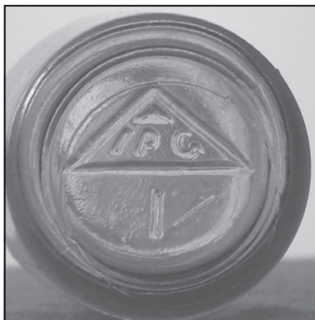
Figure 9: Triangle IPG Basemark [Lockhart]

Triangle IPG mark could be dated from 1925 to 1931. We attribute the mark to the Corporation period.