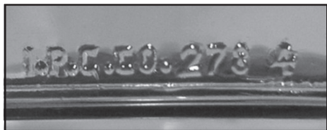
Figure 1: I P G C O Heelmarks

This mark (initials alone) appeared in slightly different formats on both heels and bases of bottles. The variation with no periods was found in contexts from the latter part of the first decade of the 20 th century to at least the early 1920s. Confirmed date ranges for the variation with periods extend from at least 1911 to 1924 (e.g., Elliott & Gould 1988:154, 189; Fowler 1998:51). Both marks were probably used simultaneously from the beginning of the company (1902 to the reorganization in 1926). However, we have no actual evidence for the use of the mark prior to ca. 1910. It is therefore possible that no mark was used during the first five or more years that the company was in business. This, however, does not fit the pattern of the Illinois Glass Co. – a firm that used the IGCo mark from at least 1880.