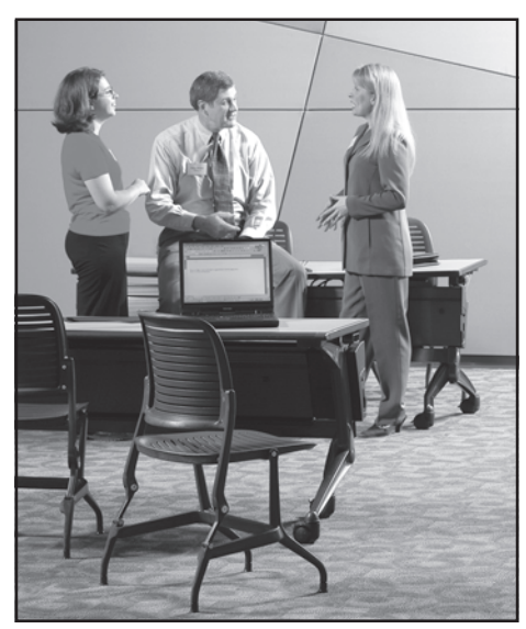
DeVos Place meeting rooms.

The Amway Grand Plaza, a four-star, four-diamond historic hotel, is the epitome of elegance. From there, I encourage you to take a walking tour around the city to fully appreciate its beauty. Once you start