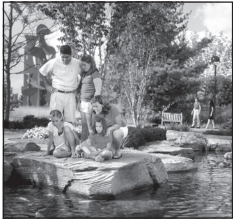
The Frederik Meijer Gardens

Michigan is a water-lovers paradise. We have 11,000 miles of inland lakes and more coastline mileage than any other state except Alaska. In the neighboring coastal communities of Saugatuck or Grand Haven 30 miles to the west, you could take could take a sunset cruise, or pilot a boat yourself and cruise past the lighthouses which dot the coastline. You could also rent a Jet Ski, kayak, or reel in "the big one" on a charter fishing trip. For landlubbers, other options include a scenic off-road sand dunes ride or just relax and dig your toes into one of the many miles of sandy beaches. From Grand Rapids, 42 miles northwest is Muskegon, the home of "Michigan's Adventure" an amusement and water park with over 50 rides and water slides. These