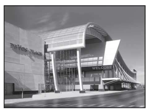
Exterior of DeVos Place, Grand Rapids.

Grand Rapids, Michigan's second largest city, is located in southwest Michigan, approximately 30 miles from Lake Michigan on Michigan's "West Coast." It is easily accessible from interstate 96 and U.S. 131, and only 184 miles from Chicago and 426 miles from