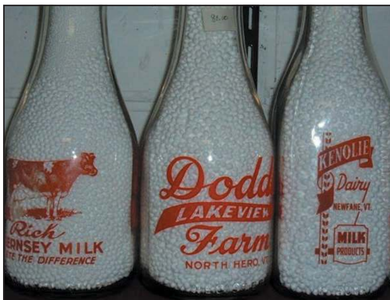
More milk bottles from Vermont. Centered is Dodd Lakeview Farms in North Hero, while the third one is from Kenolie Dairy in Newfane.