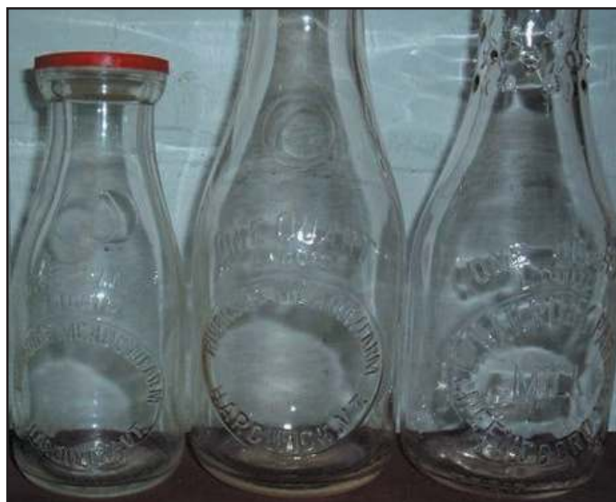
Embossed milk bottles from Vermont.