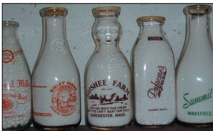
Maryland and Massachusetts bottles.