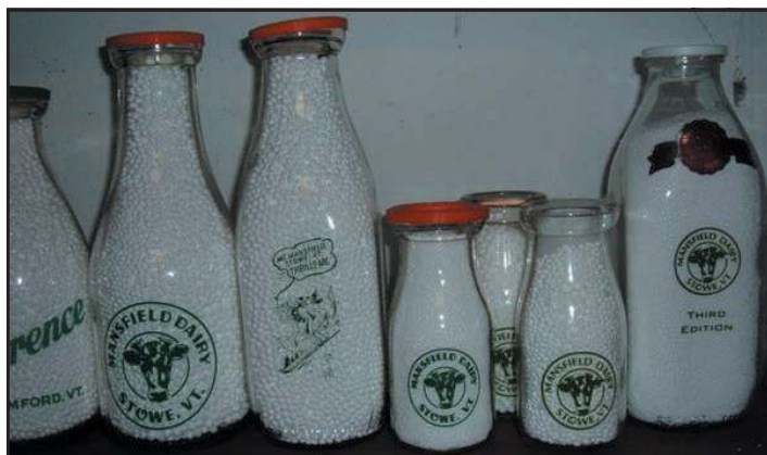
Many Vermont dairies are represented on the shelves, illustrated here is an assortment with green applied color labels.