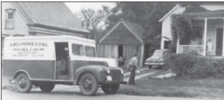
In 1949 Aime & Beatrice started a Milk Route ("Aime Bellavance & Sons") where they delivered milk to over 400 local households in eight surrounding towns.