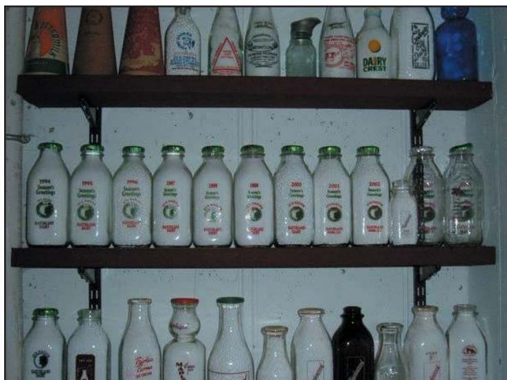
The center shelf features "Seasons Greetings" bottles from 1994-2004.