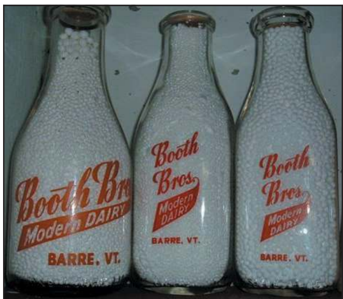
More Vermont milk bottles, these from Booth Bros. Dairy in Barre, Vt.