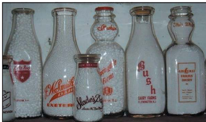
States represented here in colorful labels are Nevada, New Mexico and New Jersey. At least one bottle from all 50 states is represented in the collection.