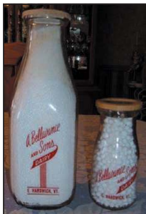
Rare A. Bellavance & Sons bottles.