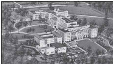
Aerial view of the Greenbrier, circa 1940.