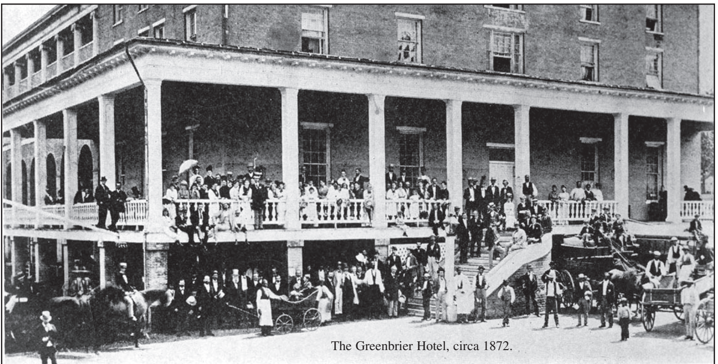
The Greenbrier Hotel, circa 1872.

December 21, 1941, 159 Germans and Hungarians arrived by a special train. Soon after that came a contingent of Japanese to make the total number of internees about 1,400. These were soon exchanged for American diplomats (July, 1942) and the Greenbrier reopened for civilian use. This only lasted one month, as on September 1,