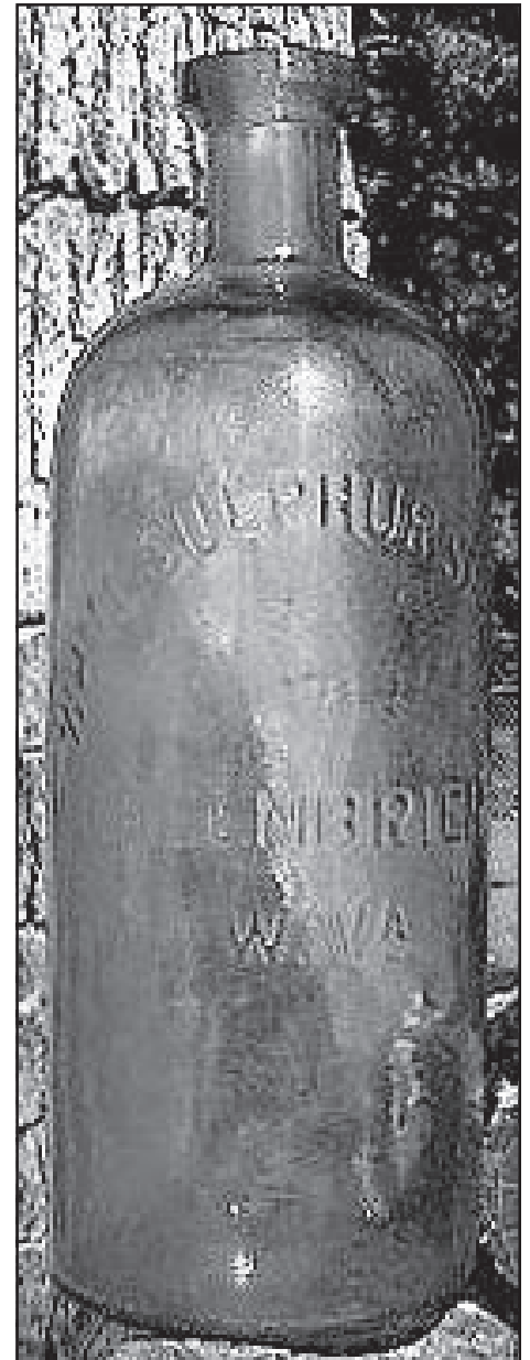
White Sulphur Springs, Greenbrier, W.Va. bottle.

Collectors Guide to the Saratoga Type Mineral Water Bottles , by Donald Tucker. Published by Donald Tucker, North Berwick, ME 03906, 2nd Ed., 2005