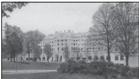
Greenbrier Hotel, circa 1915.