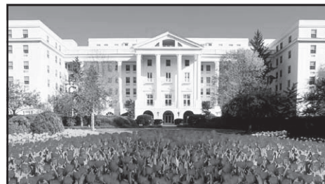
Main Street entrance to the Greenbrier.

In 1910, the Chesapeake and Ohio Railway purchased the historic resort property and embarked upon a major expansion. By 1913 the railroad had added The Greenbrier Hotel (the central portion of today's hotel), a new Mineral Bath Department (the building that includes the Indoor Pool) and an 18-hole golf course (now called The Old White Course) designed by the most prominent golf architect of the day, Charles Blair Macdonald. In 1914, for the first time, the resort was open year round and that year President and Mrs. Woodrow Wilson spent their Easter holiday at The Greenbrier and Joseph and Rose Kennedy traveled down from Boston for their October honeymoon.