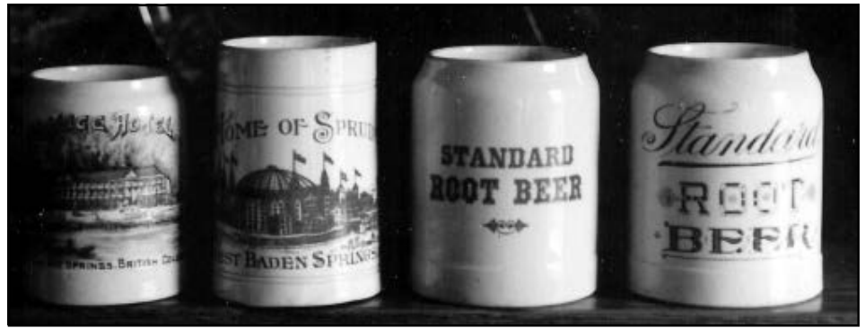
Figure 19: Thuemler root beer mugs.