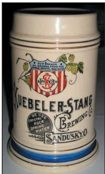
Fig. 5: Kuebler Stang beer stein.