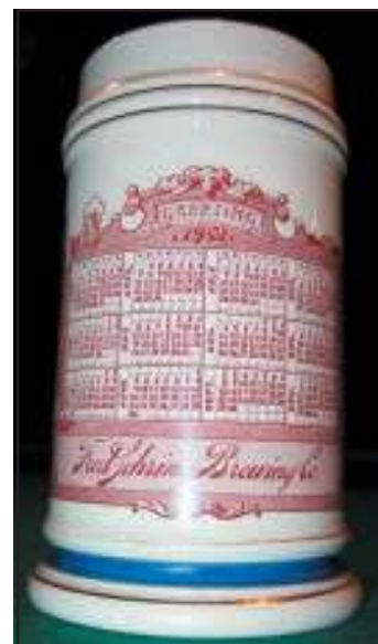
Fig. 13: Sehring 1901 "calendar" stein.