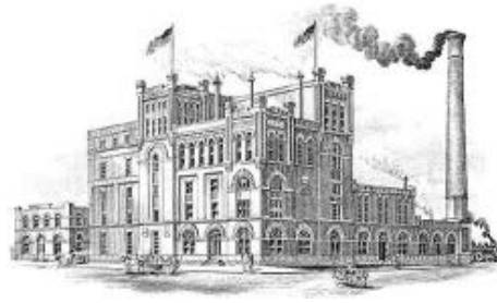
Figure 12: Drawing of Fred Sehring Brewery.

Thuemler created American patriotic decoration on ceramics for several breweries, including the American Brewery of St. Louis [Figure 9] , Heidelberg brand [Figure 10] and Consumers Brewery of Erie, Pa. [Figure 11] . All had German ties and Heidelberg’s beer ads boasted that it was made “The old German way.”