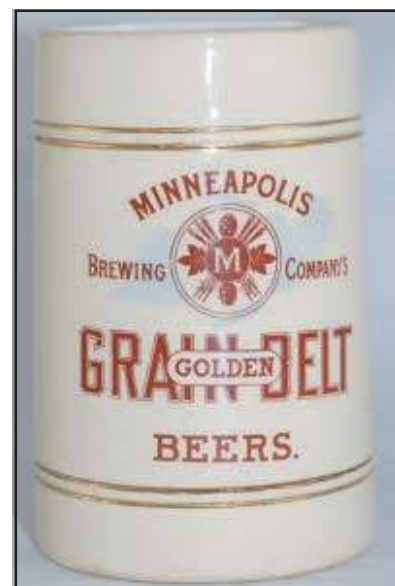
Figure 16: Grain Belt beer stein.