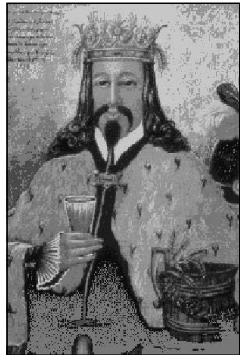
Figure 18: King Gambrinus.

added by hand. [Figure 16] The handle of this vessel, also found on other Thuemler products, featured a ceramic portrait of King Gambrinus [Figure 17] . Gambrinus was a storied German royal and is the unofficial patron saint of beer and brewing [Figure 18] . German legends dating from the 1500s claimed that the king learned the art of making beer from Isis, the ancient Egyptian goddess of motherhood and fertility.