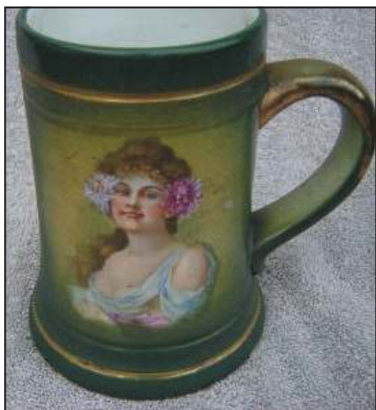
Figure 14: Sehring 1905 stein with lady.