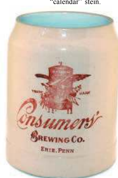
Figure 11: Consumer Brewery stein.