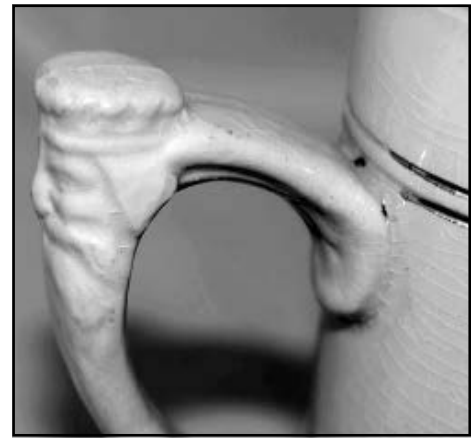
Figure 17: King Gambrinus handle.