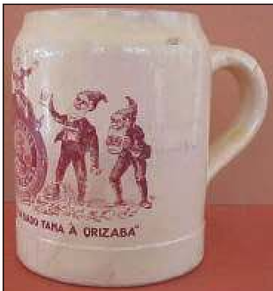
Figure 8: Mexican Brewery mug.