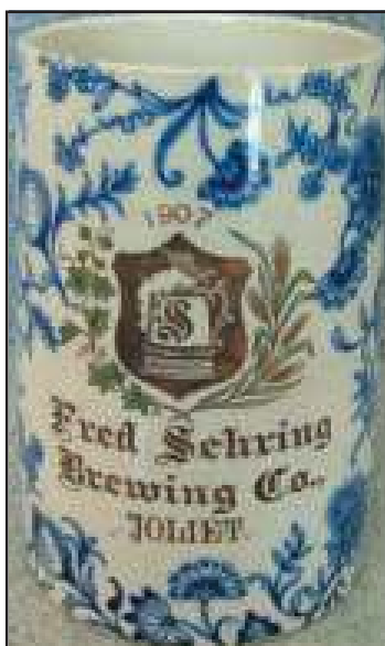
Figure 15: Sehring 1907 stein with flow blue design.