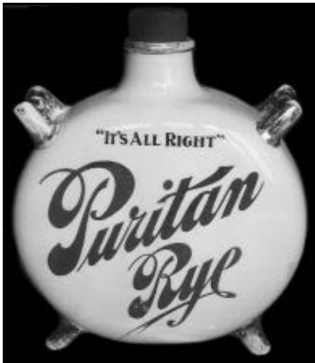
Figure 22: Puritan Rye canteen jug.