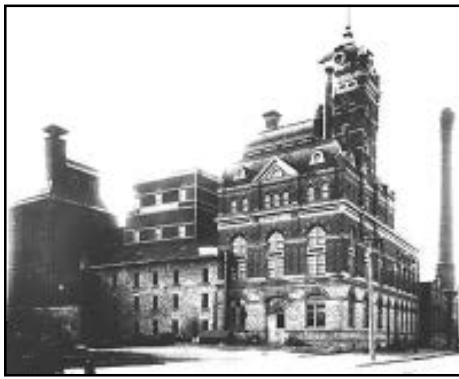
Figure 4: The Kuebeler-Stang Brewery.

ornate tower was the dominant landmark in the west end of Sandusky.” [Figure 4]