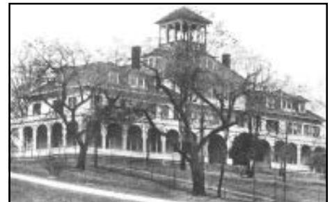
Figure 23: The Elmhurst Inn, Sewickley, Pa.