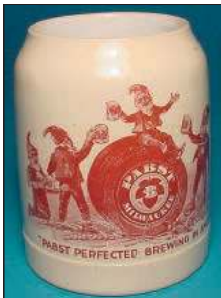
Figure 7: Pabst Beer mug.