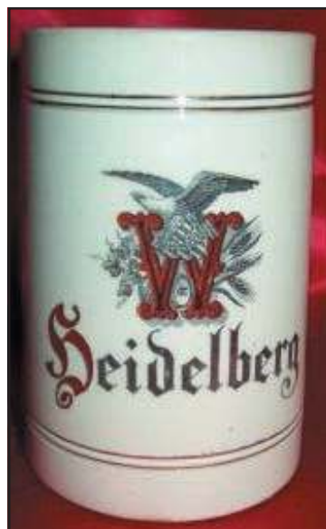
Fig. 10: Heidelberg Beer stein.