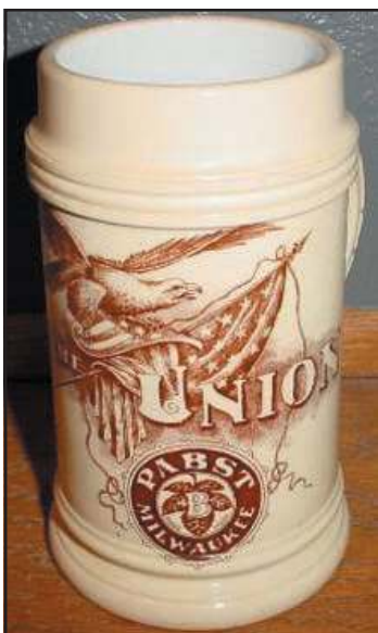
Figure 6: Pabst Beer stein.