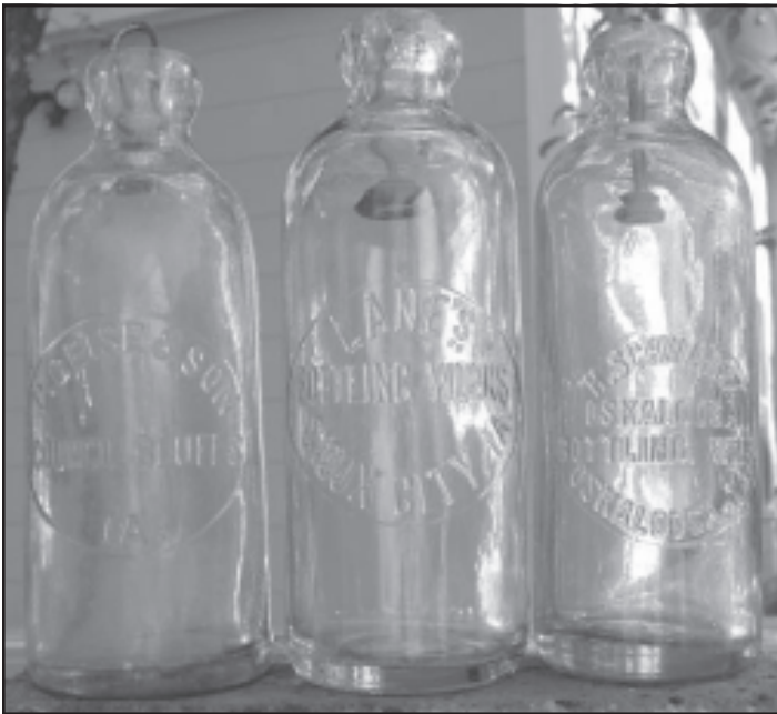
Three off color Hutches. Apple green from Council Bluffs, light pink from Sioux City, deep bluish aqua from Oskaloosa.