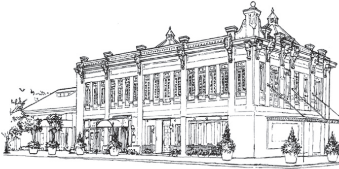
The Magnolia Brewery is one of only two remaining buildings of what was once the Houston Ice & Brewing Company.