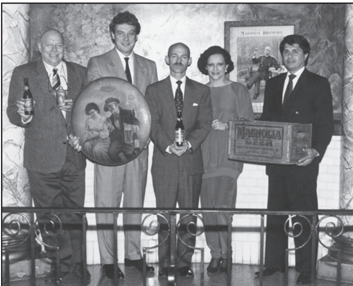
Contributors to the Magnolia Brewery Building Museum.

For more information, please call the museum at: (713) 223-8508.