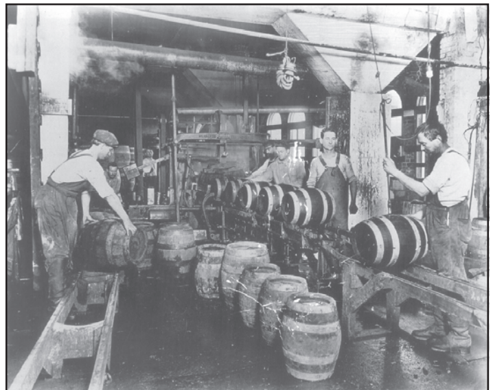
Hard at work to get the barrels out each day.