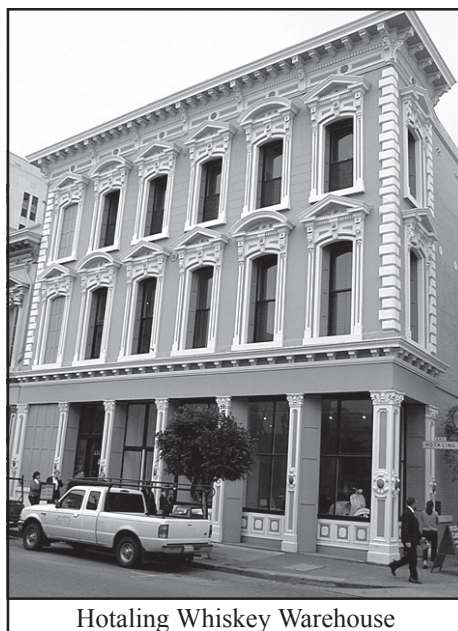
Hotaling Whiskey Warehouse