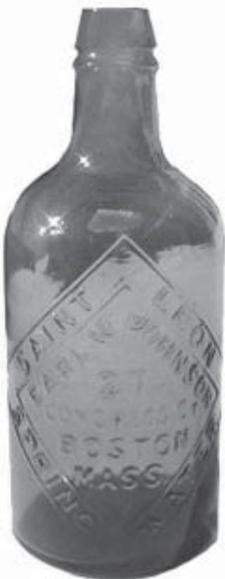
St. Leon quart