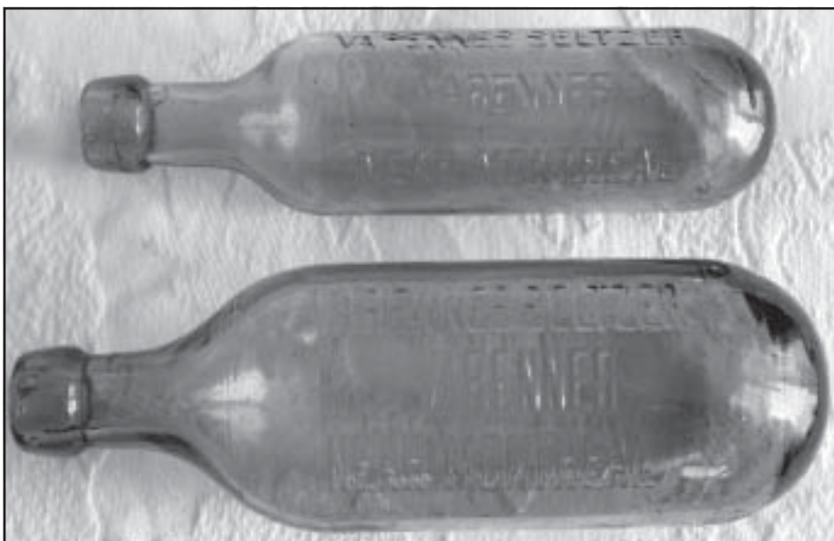
Varennnes Seltzer bottles, pint and quart.

To date, no marked bottles from the Varennnes Springs have been found from the 1840-1859 period. The most fascinating reminders of the second era of Varennnes are two cornflower blue round