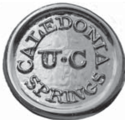
Above: Close-up of Caledonia Springs seal.

Caledonia had four springs: Sulphur, Saline, Gas and Intermittent, as well as several hotels, a racetrack, a circular railroad for guests, and a glassworks.