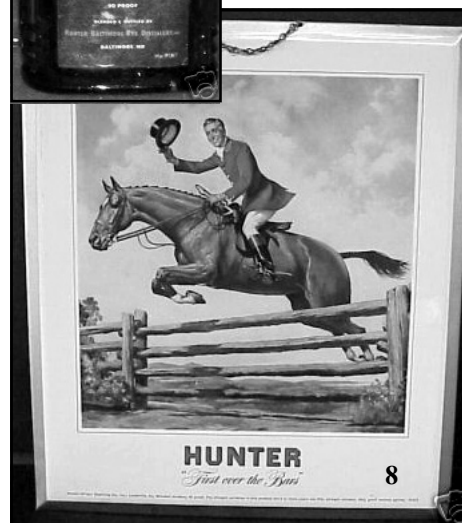
Figure 8: 1942 national ad for Hunter Rye