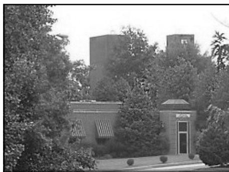
Figure 15: The Bowman Fredericksburg facility