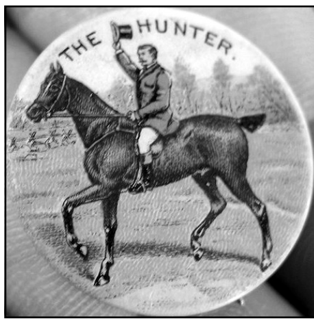
Figure 4: Hunter Rye celluloid badge.