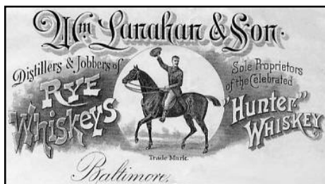
Figure 1: An early Lanahan ad.

Never shy about extolling the virtues of