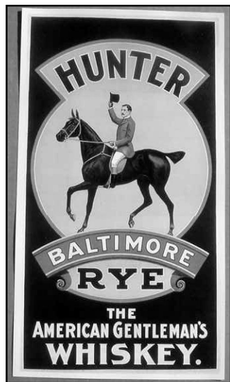
Figure 2: Hunter Baltimore Rye label.