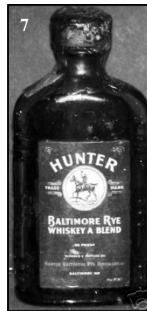
Figure 7: 1930s pint bottle of Hunter Rye

The Hunter Rye brand survived Prohibition. The name eventually was bought by Seagram, one of the big whiskey cartels out of Canada. About the same time Seagram purchased the Wilson Distillery in Baltimore, producer of Atlas Bourbon. It merged the two operations and began making Hunter Rye at its Calvert distillery in Baltimore. When that facility subsequently was shut down, the Hunter-Wilson Distilling Company was relocated to Seagram’s Louisville plant. Apparently because “rye” was losing popularity, Hunter became a Kentucky bourbon.? It did not give up its “Tally Ho!” image, however. Its advertising featured a man on horseback clearing a jump with the slogan: “The first