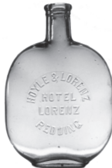
Hoyle & Lorenz / Hotel Lorenz / Redding