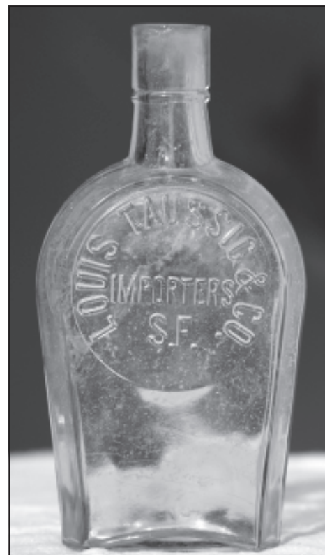
Louis Taussig & Co / Importers / S.F.