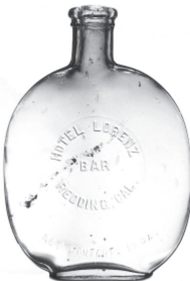
Hotel Lorenz Bar / Redding, Cal.