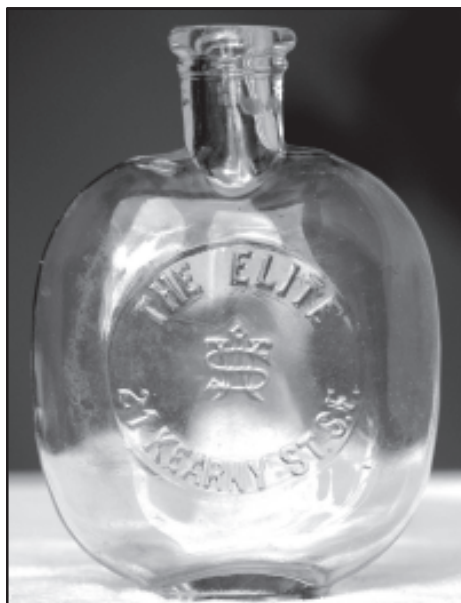
The Elite / 21 Kearny St S.F.