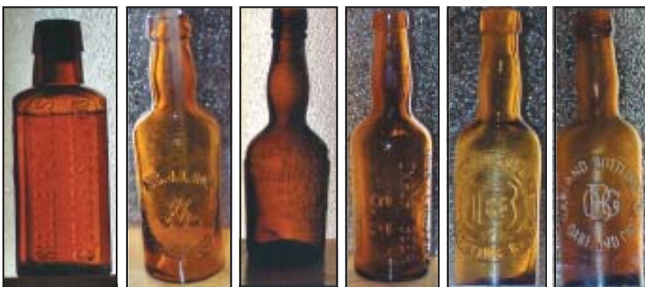
[ 1 ]