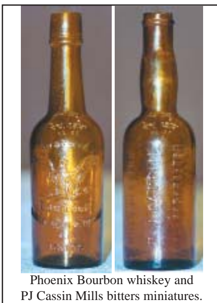
Phoenix Bourbon whiskey and P.J. Cassin Mills bitters miniatures.