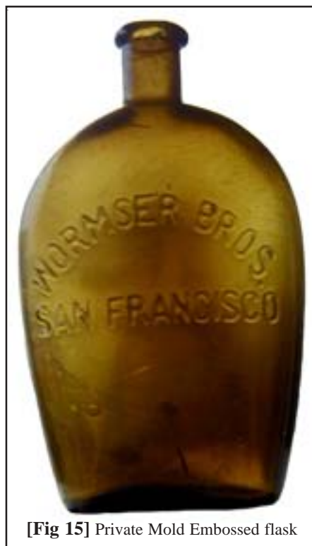
[Fig 15] Private Mold Embossed flask

This large union oval was distributed through the mining camps of the West. An early and fairly common flask, the key to collecting it is to find a nice yellow green