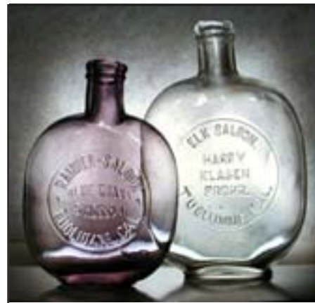
[Fig 9] Pioneer Saloon and Rainier Saloon pumpkinseed flasks from Tuolumne, CA

A few of the olympia-style flasks exist with none south of the Bay Area, to my knowledge.