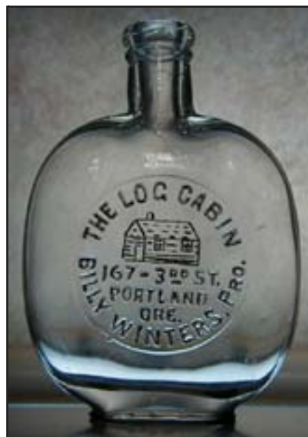
[Fig. 12] A nice Oregon "Picture" flask

go with fifteen shooflies, four basket-base shooflies, three olympia-style, one screw-cap pumpkinseed and two double-ring top pumpkinseeds.