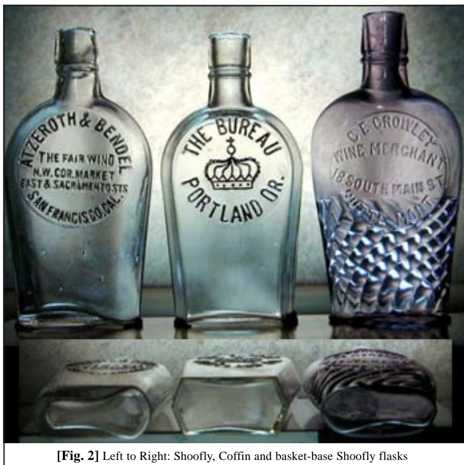
[Fig. 2] Left to Right: Shoofly, Coffin and basket-base Shoofly flasks

area west of the Rockies, although the style was quite popular in Texas and Oklahoma Territory.