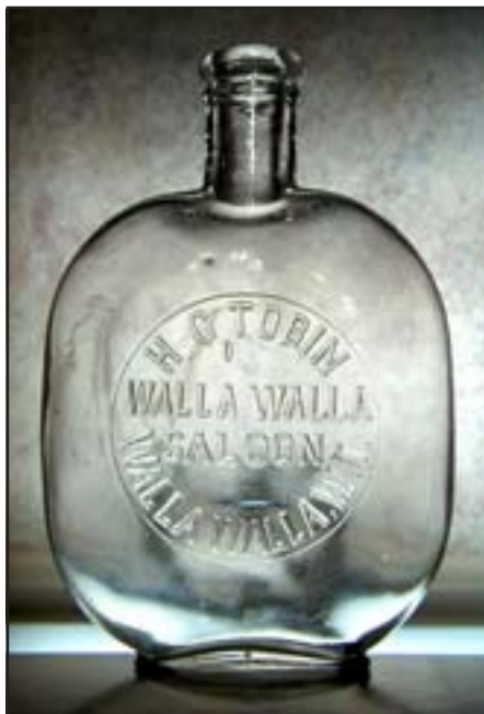
[Fig 8] Desirable Washington Territory "Saloon" pumpkinseed

The following listing will give an idea of what is available from each of the states west of the Rockies: