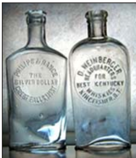
[Fig. 4] Olympia and strap-sided flasks

Seldom does a severely damaged specimen warrant more than a few dollars as an example for the "Crier" shelf. But, with a very rare bottle, the occasional surprise occurs - as an instance, a Gem Saloon coffin flask from Elko, Nevada, with a blown-out shoulder recently realized $170 on EBay. This is an instance of rarity (only two other specimens known) outweighing condition as a factor in determining value.