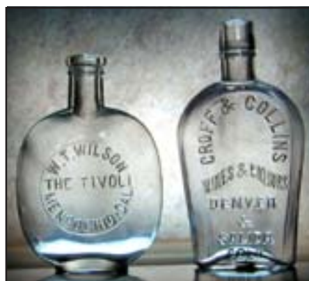
[Fig 5] Rare California pumpkinseed flask and common Colorado coffin

The local appeal effect for one given community is well demonstrated by the A. Weinberg flask [Fig. 7] from Tacoma, Washington Territory.