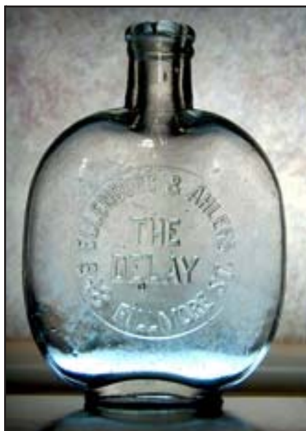
[Fig. 10] An appealing bar name