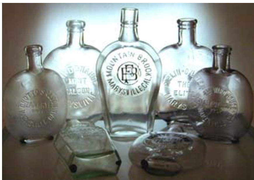
[Fig. 3] A grouping of Marysville, California Coffin and Pumpkinseed flasks

Nicks, chips, bruises and other more serious damage truly does affect value. This is particularly true in the more common bottles.