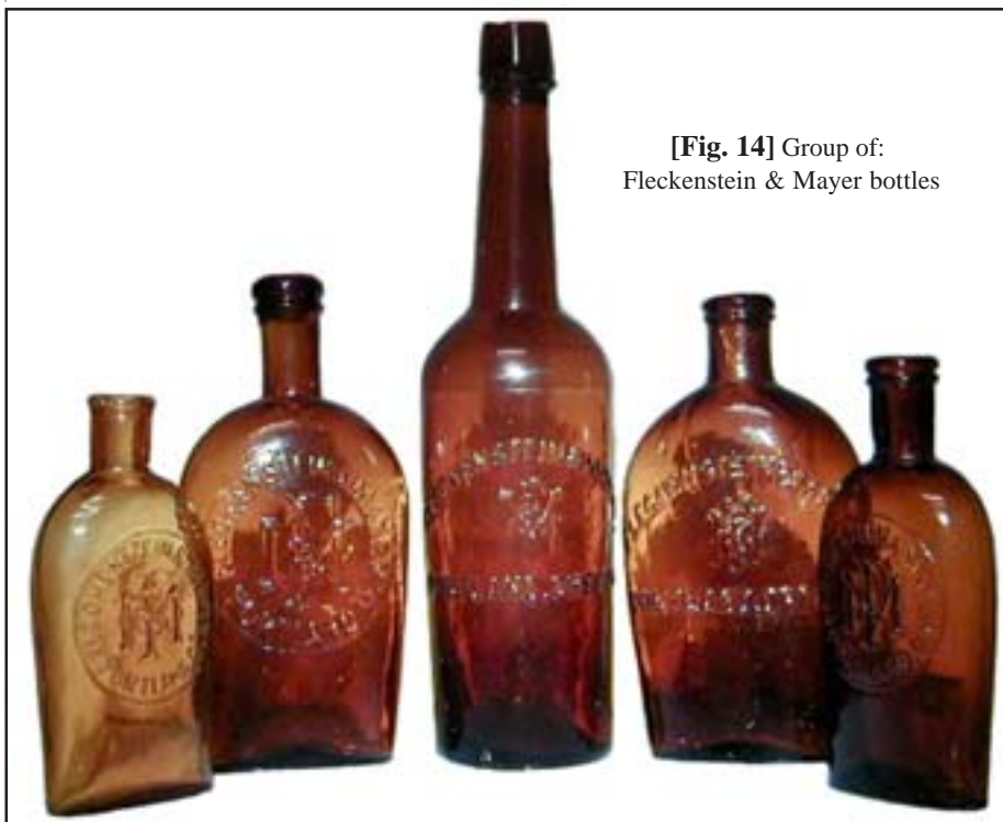
[Fig. 14] Group of: Fleckenstein & Mayer bottles

Add to this the crudity and tremendous color variation noted in these flasks and the demand for them becomes understandable. The most ardent collectors try to assemble a complete collection of the colored flasks. To my knowledge no-one has ever been able to make the claim that they once owned an example of every bottle. This is a testimony to the extreme rarity of certain of the bottles.