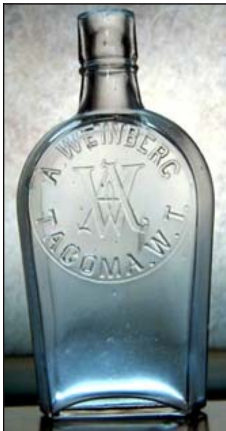
[Fig. 7] A. Weinberg Tacoma W.T. coffin flask

Montana - Montana has a nice assortment of flasks, including some Baltimore ovals, "medicine"-type, defenders and dandies to