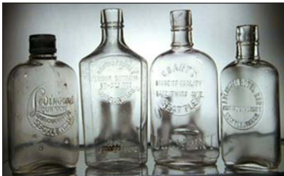
[Fig. 1] Left to Right: Defender. Washington, Eagle and Dandy flasks

The coffin and shoofly flasks look very similar when viewed from the front or