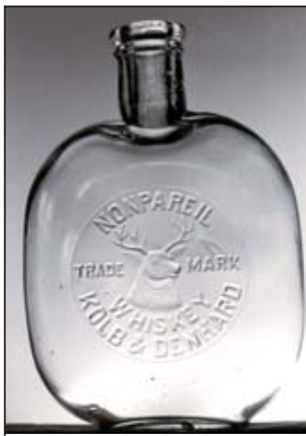
[Fig. 11] Nonpareil Kolb &amp; Denhard