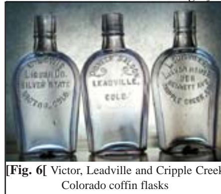
[Fig. 6] Victor, Leadville and Cripple Creek Colorado coffin flasks

Another flask that fits this category is