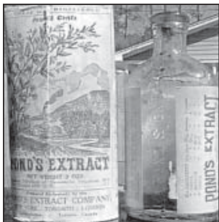
Pond's Extract embossed bottle with packaging. From the Pond's Extract Company. Note the package has a flowering shrub on the front. No doubt an image of Witch Hazel.

The active ingredient with the astringent properties is Tannin. It, no doubt, has medicinal properties. The problem with effectiveness arises with the distillate. When the leaves are distilled, almost all the Tannin is removed. This unfortunate fact caused the U. S. Dispensatory to state in 1916, "As whatever slight therapeutic virtues witch hazel possesses seems to depend on it's tannin, it is obvious that this distillate cannot represent the drug." "This much used and still lauded witch hazel. . . must depend for its virtues upon the alcohol they contain, and the faith