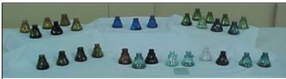
Keith Leeders, Elmwood Park, Illinois: Inks.

The exhibition area was rounded out with two large multi-table displays of very unique twentieth-century era collectibles. Gene Joo (Burlington, North Carolina) enlightened new and old collectors alike with a display of prohibition era liquor