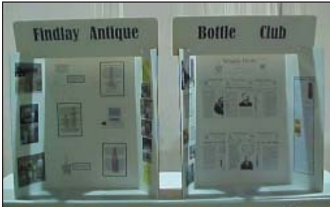
Findlay (Ohio) ABC: Findlay Antique Bottle Club.