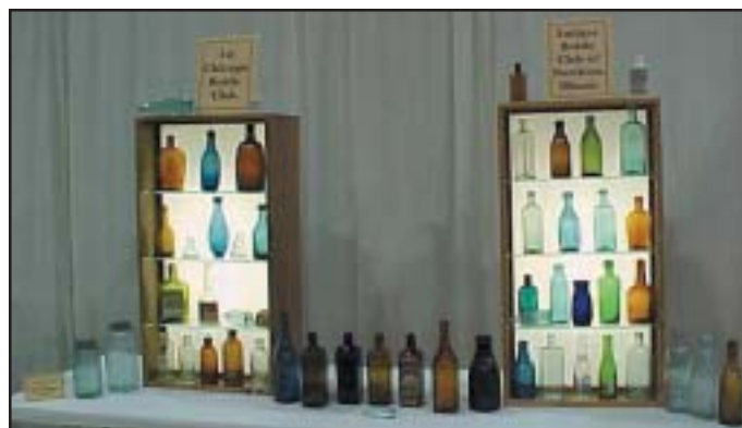
First Chicago BC: Chicago Area Bottles.