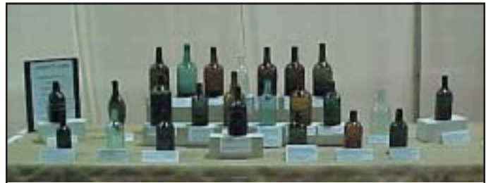
Howard Dean, Westernville, New York: Saratoga Mineral Water Bottles.

When you have a comfortable, well-lighted facility full of beautiful glass and are surrounded by the best group of folks in the collecting world, it's got to be a great show! Hope to see all of you at our next great show — the 2004 EXPO in Memphis!