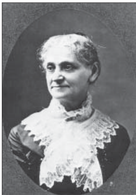
[Fig. 11] Lydia E. Pinkham as she appeared in 1879. This photograph was the one that became the trademark for the famous vegetable compound.

about largely as the result of the 1921 by-laws which gave the Pinkhams control of the executive branch of the company and the Goves control of the purse strings .