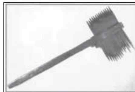
[Fig. 17] Mrs. Nation began her destruction of bars in the name of "Prohibition" on June 1, 1900 in Kiowa, Kansas where she attacked three "joints." She used stones, brickbats, full ceramic malt bottles, and one billiard ball as ammunition. She did not adopt the use of her now famous "hatchet" (which in reality was a Crandal hammer used by masons to dress building stone – until her visit to Wichita some six months later.

1911 – Carrie A. Nation, who was an early member of the "Women's Christian