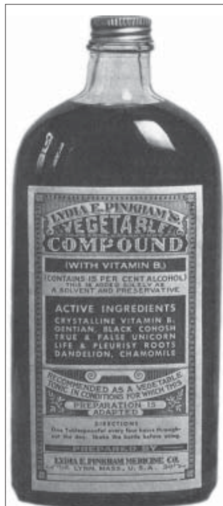
[Fig. 16] A bottle of Lydia E. Pinkham's Vegetable Compound from the 1940s. The medicine was the same as it was in 1873 except Vitamin B1 was added and the amount of alcohol was cut from 18% to 15% – that was a reduction in alcoholic content from 36 proof to 30 proof.