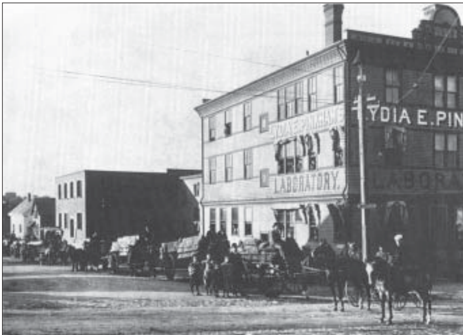
[Fig 10] The Lydia Pinkham factory in Lynn, Mass. was built in 1886 (the year Coca-Cola was invented), The factory was closed in 1973 after making the famous vegetable compound for 87 years.