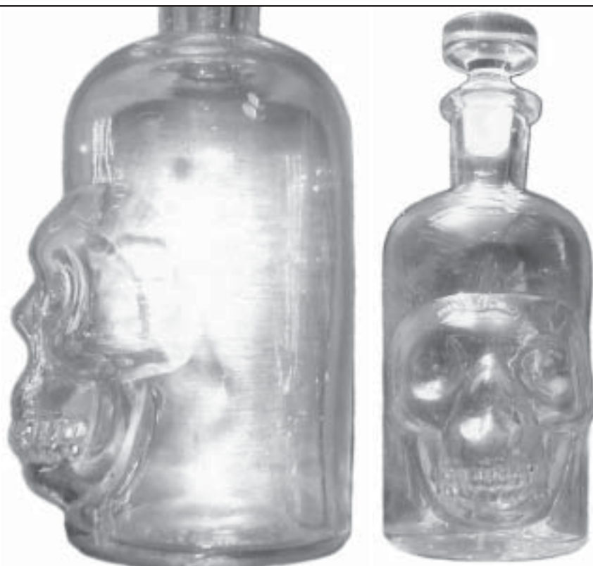
Shown is the close-up side view and front view of another ultra-rare poison bottle (KC-114), which was patented in 1875, according to its base embossing. It comes in two different sizes. All of the half-dozen or so known specimens have ground-glass stoppers.

Morgan, Roy, "The Benign Blue Coffin" (Kollectarama, England 1978).