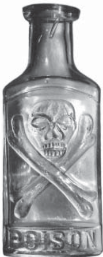
This is the ultra-rare KR-79 poison bottle, of which only two specimens are known to exist, although there are rumors of the existence of several others.

or colors of previously categorized types, but some have been brand-new types. Let's end this article by looking at two such bottles: KC-114 and KR-79 . Knowing Rudy Kuhn's classification system, by the way, instantly tells us that the former is cylinder-shaped and the latter is rectangular-shaped.