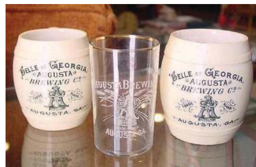
Augusta Brewing Company mugs and shot glass