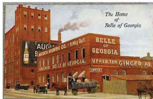
Augusta Brewing Company postal advertising card for Belle of Georgia.

Now to find out more information on the "Belle of Alabama." And does a "Belle of Havana" exist as well? The author wrote to Havana's main library asking if it had information pertaining to the Augusta Brewing Company sales in Cuba. That letter was sent three months ago and there has been no response. He also contacted some Jacksonville bottle collectors to see if anyone had found the labeled Belle of Florida. So far, there has been no reply.