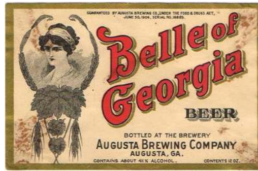
Belle of Georgia beer label, bottled by Augusta Brewing Company, Augusta, Georgia

On Oct. 27, 1899, The Augusta Chronicle carried this story: "The Augusta Brewing Company made another large shipment, 150 casks, of their celebrated bottled beer to Cuba yesterday, The Augusta Brewing Company's export beer is becoming a favorite on the island, their frequent shipments demonstrating this fact." On Oct. 30, 1899, a news article in The Chronicle noted ". . . the Augusta Brewery's product has an extensive sale today in Geor-