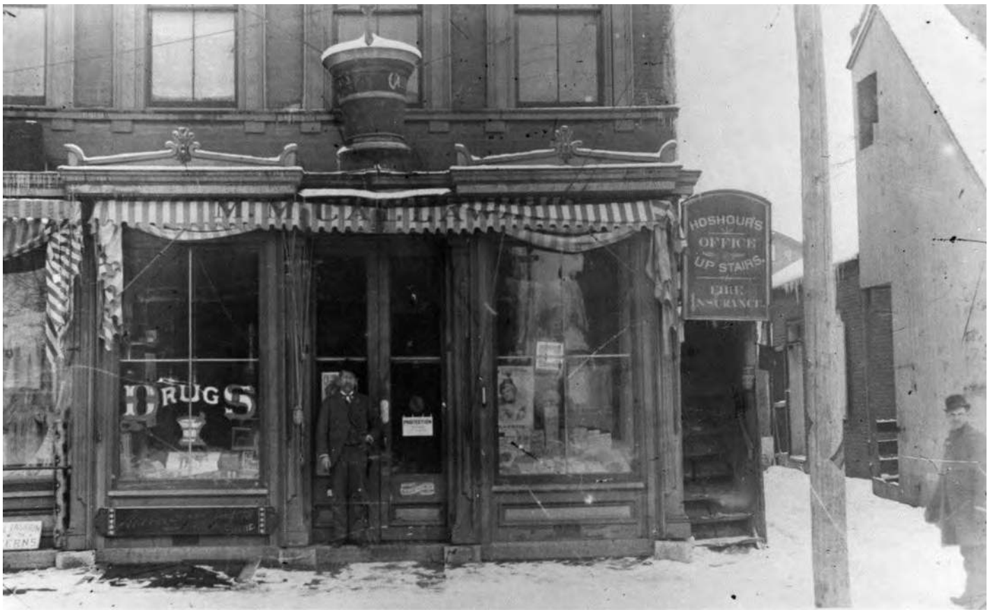
Original location of all the display cabinets, located in the Hooks drugstore museum

fully catalogue and document every item in the collection. Each item is photographed, assigned an accession number, and its location clearly identified in our software database "Past Perfect" which is designed to organize and catalogue museum collections. So far we have catalogued over 3,000 individual artifacts, with likely about another 1,000 still to go. The long-term goal is to eventually place our collection on-line, so that collectors and researchers around the world may use the images and description of artifacts in our collection as a tool to help interpret the history of drugstores and medicines in the US.