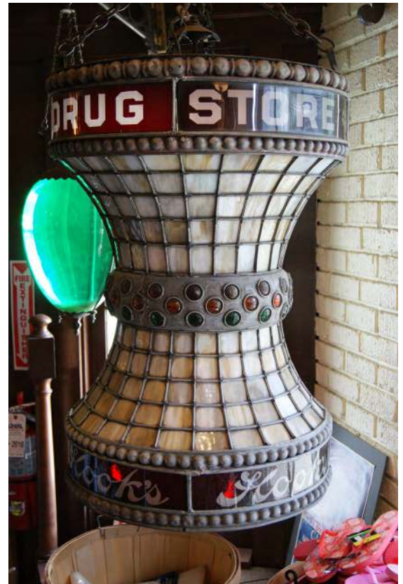
An Original hanging store display form Hook's Drugstore, which can be found hanging in the Museum

*Hook's Historical Drug Store and Pharmacy Museum is open seven days a week, noon to six p.m., at the Indiana State Fairgrounds, Indianapolis. No admission charge.