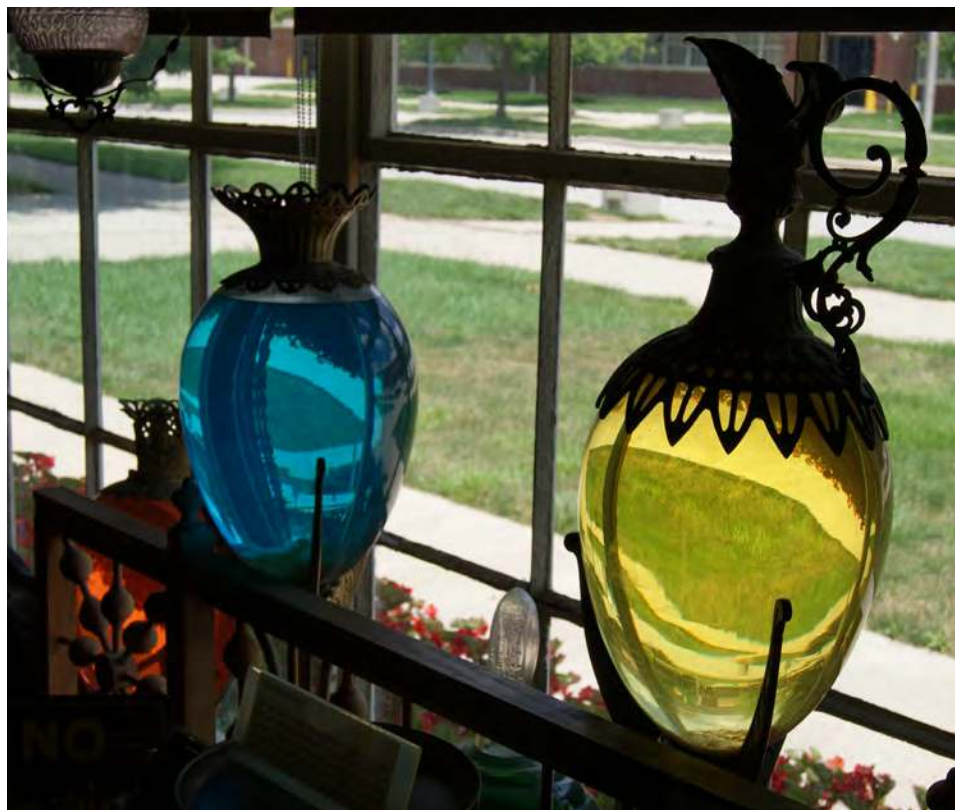
Store Displays would create vivid colors and draw in the customers

Hook's Drugstore Museum is open 9 a.m. to 9 p.m. every day during the 17 days of the State Fair, and during selected other events during the year, depending on traffic and parking restrictions that come with those individual events. We are also available to open for special events and tours upon request, subject to charges to defray the cost of staffing and other related. Find us on Facebook, Hooks Drugstore Museum.