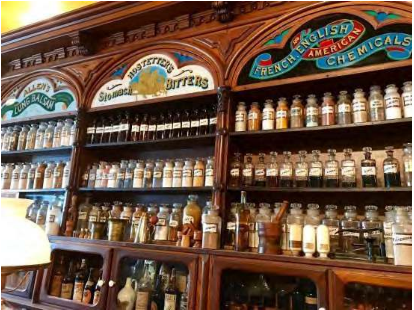
Original Store Displays with original glass. These cabinets are from an old Drugstore in Cambridge City Indiana.

wished to see the antiques of their profession and business preserved and displayed for future generations. The Museum displays apothecary bottles and patent medicines in the museum much as they would have been in a working drugstore of the era. The back cabinets on one side has glass doors, where “ready-made” medicines and other products could simply be taken down on the shelf by a clerk or apprentice and sold directly to the customer. The other side of the store is stocked with apothecary bottles filled with bulk materials. These materials were utilized to create custom made medications, as well paints, stains, adhesives, spices, pesticides, perfumes, and more. The druggist was really a neighborhood chemist who could manufacture on demand small quantities of a myriad number of products that might otherwise difficult to obtain in many rural areas of the country.