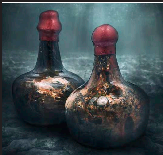
At Christie's Finest and Rarest Wines and Spirits sale in June, two unique bottles of wine will be auctioned. These bottles have been tested to find they contain "powerful red wine" dated between "1670 and 1690." The origin of the wine is unknown, as the bottles, along with 12 others, were found within a shipwreck off the coast of Germany in 2010. The bottles full of wine are estimated to bring between $32,942 and $38,010, and will be sold with "specially designed water-filled storage tanks" and the equipment needed to maintain them.