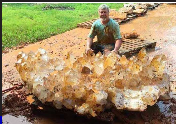
(left) A four million dollar piece of quartz found in Arkansas