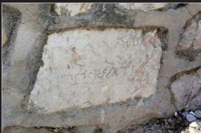
(Above) In Turkey, an archaeologist working with a road construction crew found what is believed to be a 2,300-year-old tablet in schoolyard garden wall. The tablet was removed by museum officials who are authenticating the age of the tablet which is written in ancient Greek and believed to be once attached to a statue honoring a local city serviceman at the time.