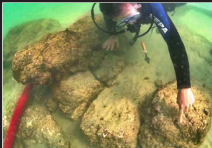
(Above) While studying a bay at Tel Dor along the Mediterranean Sea in Isreal, researchers came across the ruins of an ancient fort believed to be the site of many military battles 2,200 years ago. The site of Tel Dor has given evidence of Phoenician, Hebrew, Roman and Byzantine activity, leading this fort to be a significant find in the study of biblical military strategies. Israeli and American professors have teamed up on the further excavation and research of these ruins.