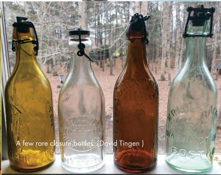
A few rare closure bottles. (David Tingen)