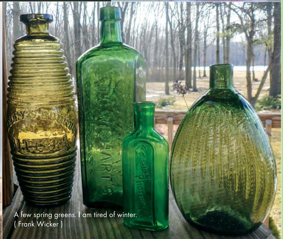
A few spring greens. I am tired of winter.