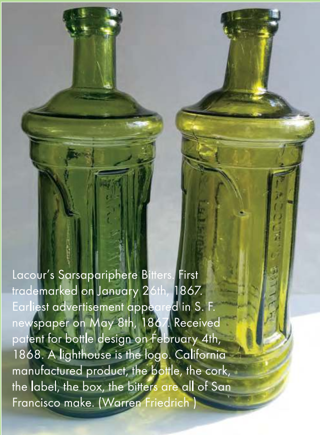
Lacour's Sarsaparilphere Bitters. First trademarked on January 26th, 1867. Earliest advertisement appeared in S. F. newspaper on May 8th, 1867. Received patent for bottle design on February 4th, 1868. A lighthouse is the logo. California manufactured product, the bottle, the cork, the label, the box, the bitters are all of San Francisco make.