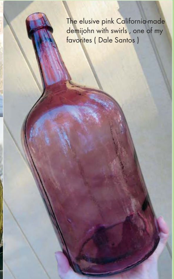
The elusive pink California-made demijohn with swirls, one of my favorites