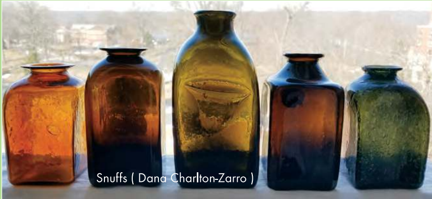
Snuffs ( Dana Charlton-Zarro )

A collection of spectacular and inspiring photographs from around the world and around the web. Please feel free to submit your images for consideration.