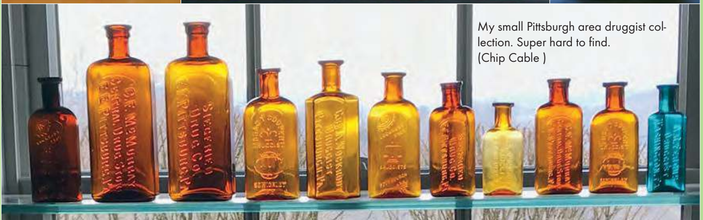
My small Pittsburgh area druggist collection. Super hard to find. (Chip Cable)