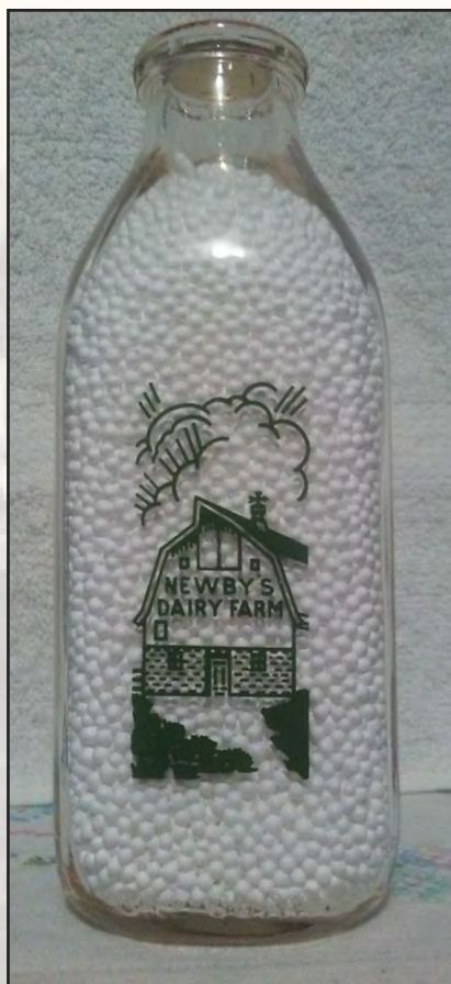
Square Quart Newby's Dairy Bottle (back)