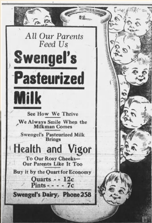
Swengel Dairy Ad from the Seymour Tribune Feb.. 08, 1919