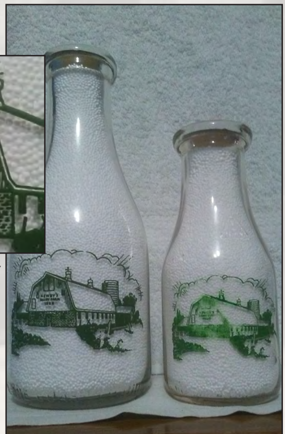
Quart and Pint Newby's Dairy Bottle From Roy's Dairy (Back)