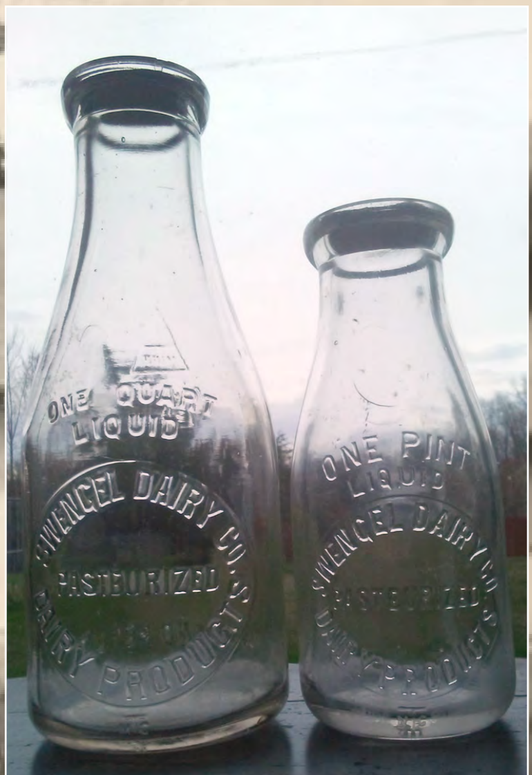
Set of Swengel Dairy Milk Bottles

By that time, they had hired nine employees, and more than 125 local dairy farmers sold milk and cream to the dairy for distribution. On September 14, 1925 Arthur Newby, who had been a silent