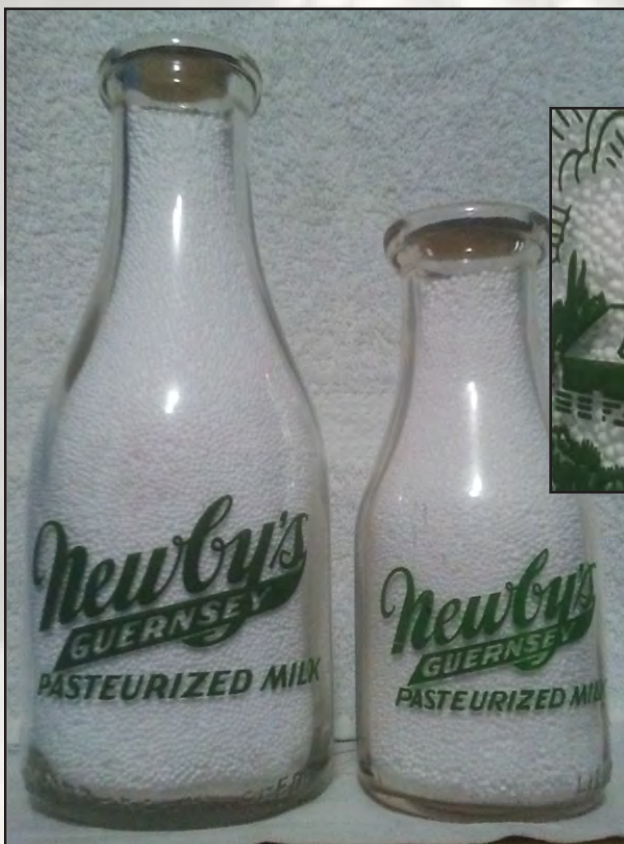
Quart and Pint Newby's Dairy Bottle From Roy's Dairy (Front)