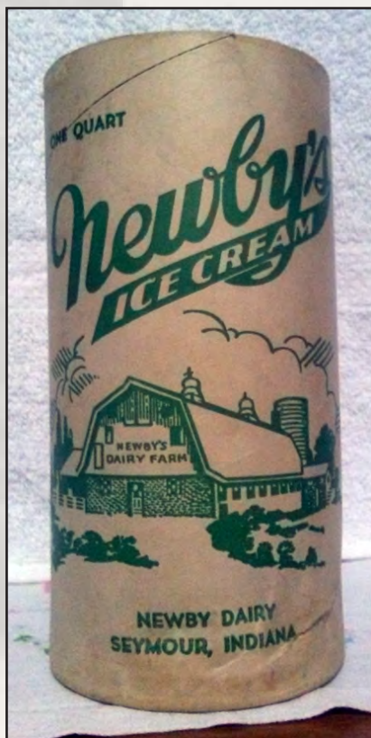
Front and Back of Newby's Dairy Ice Cream Container, The picture on the container is their store front in Downtown Seymour