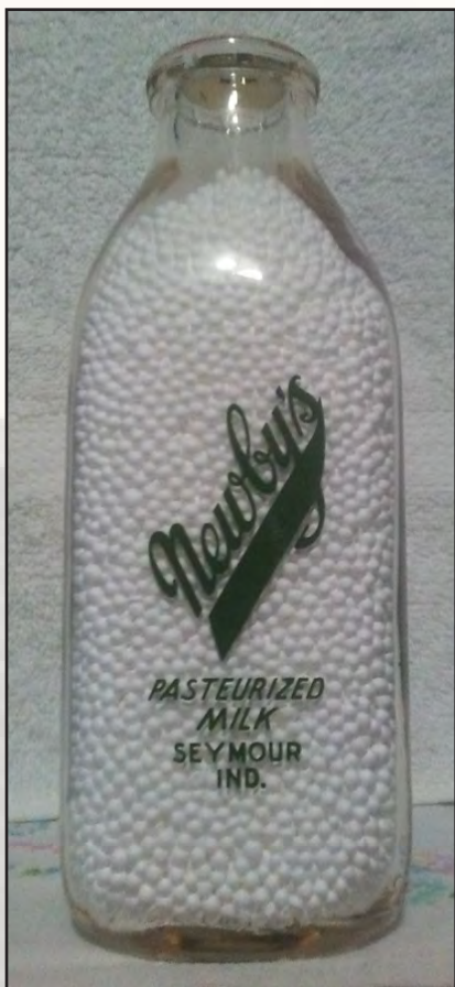
Square Quart Newby's Dairy Bottle (front)