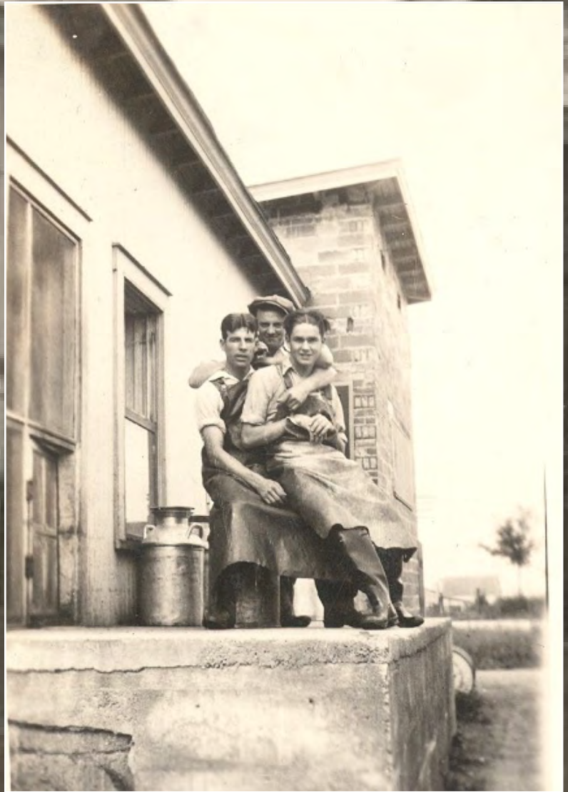
Three Employees at Swengel Dairy 1923