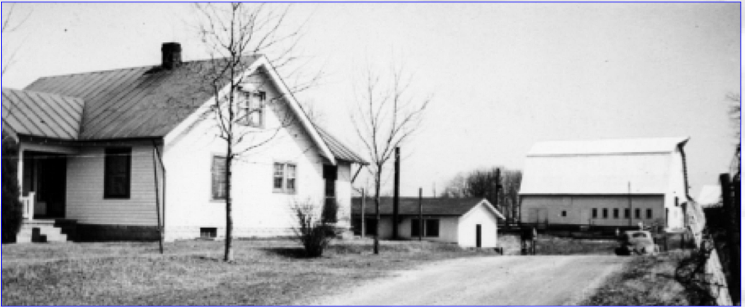
The Ruddick Dairy operated from 1935 - 1964 just South of US Hwy 50 on the Jackson-Jennings County Line