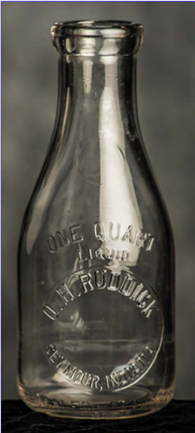
Ruddick bottles are extremely rare and there are two versions. Here is one version