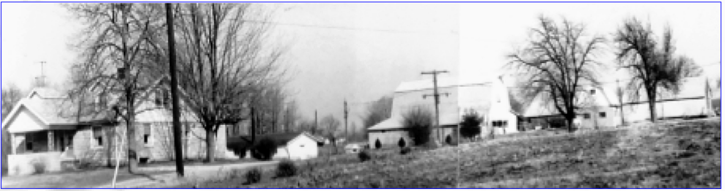
Another view of the Ruddick Dairy farmhouse and barns