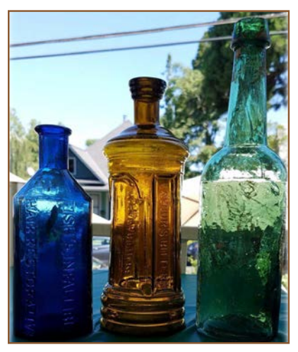
Another group of wonderful looking bottles on display at Rick Pisano's house during the pot-luck dinner

In order to get my 'bottle fix' I have joined the social media crowd on Facebook. A rather lively bunch is located at "California Antique Bottles" which has provided some much needed entertainment, with collectors from all over the country showing their bottles of the day.