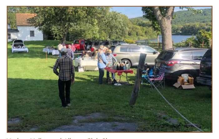
Hudson Valley and Albany Club Show, everyone keeping their distance

First up in July was Shupp's Grove Bottle Show in PA. This has always been an outdoor show. But there still needed to be precautions in place. I did not personally attend this year, but from all indications, the show was successful and there were little to no issues. In fact, it went well enough that they decided to have a fall show as well. That show is going to be on the weekend of Sept. 19 – 20th. Glass Works Auctions is holding a Live auction in conjunction with this show. By the time this article is published, it will have already been held, so good luck to all involved!