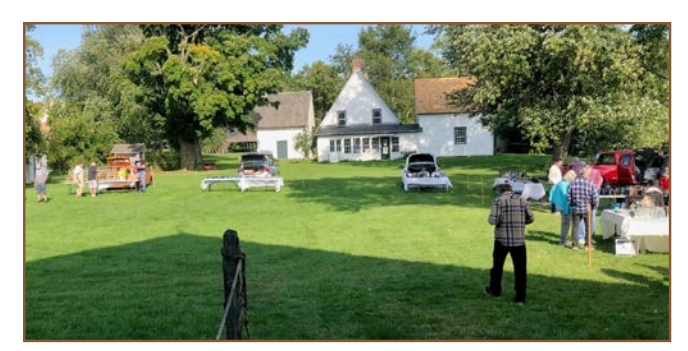
Another view of a beautiful day at the Hudson Valley and Albany Club Show

among the members, we decided to try an informal "tailgate" show. We were able to secure the fields of the Mabee Farm in Rotterdam Junction, NY. This farm is a part of the Schenectady County Historical Society and is just a great place! Plenty of field space, easy access off State Route 5S and even access to