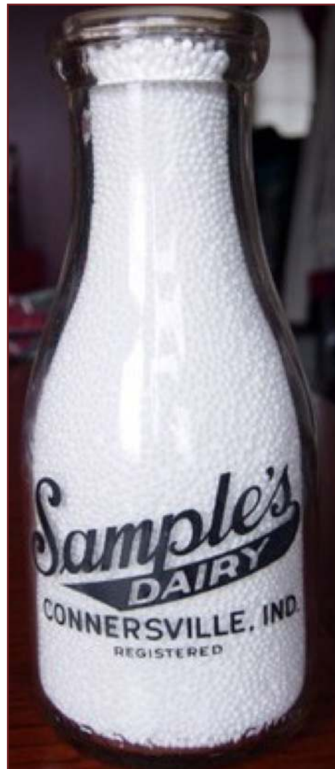
Sample's bottle from Connersville