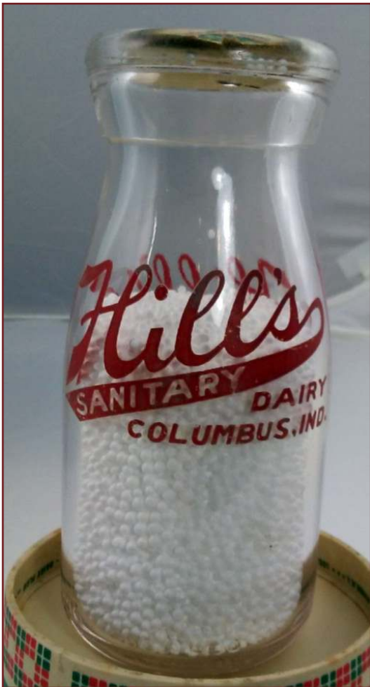
Hill's Dairy bottle from Columbus, which is who Sample purchased.