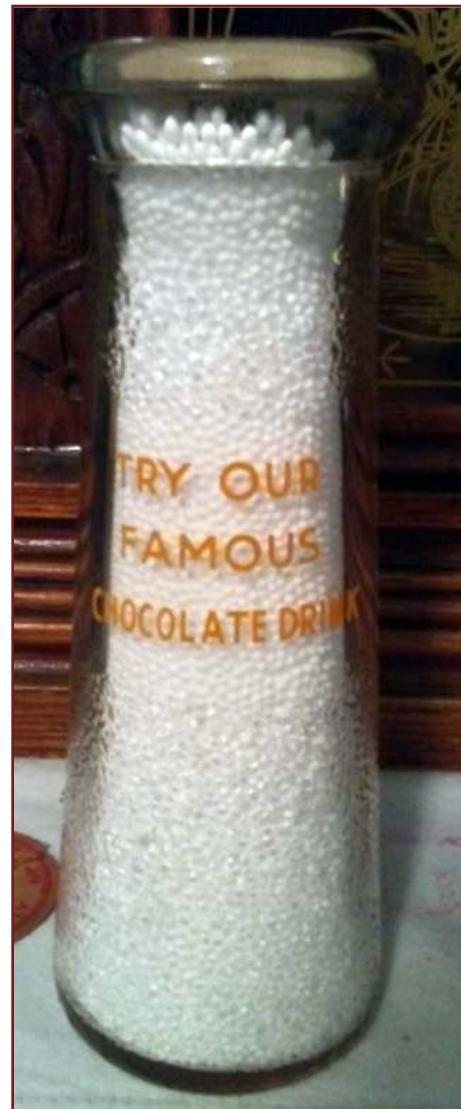
Sample's Chocolate Drink bottle from Columbus, front and back images