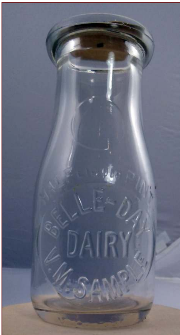
Belle-Day Dairy bottle from Carrollton