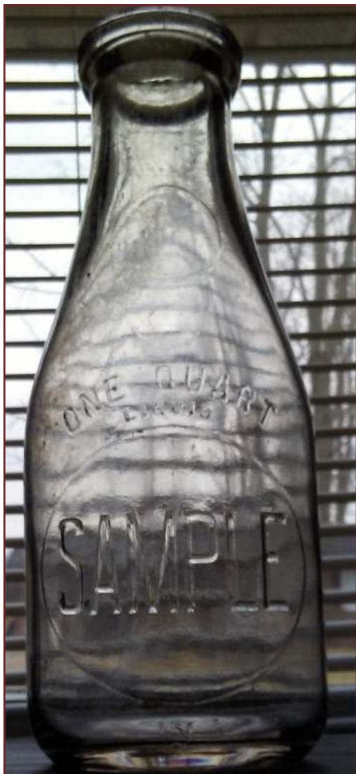
Sample's bottle from Carrollton