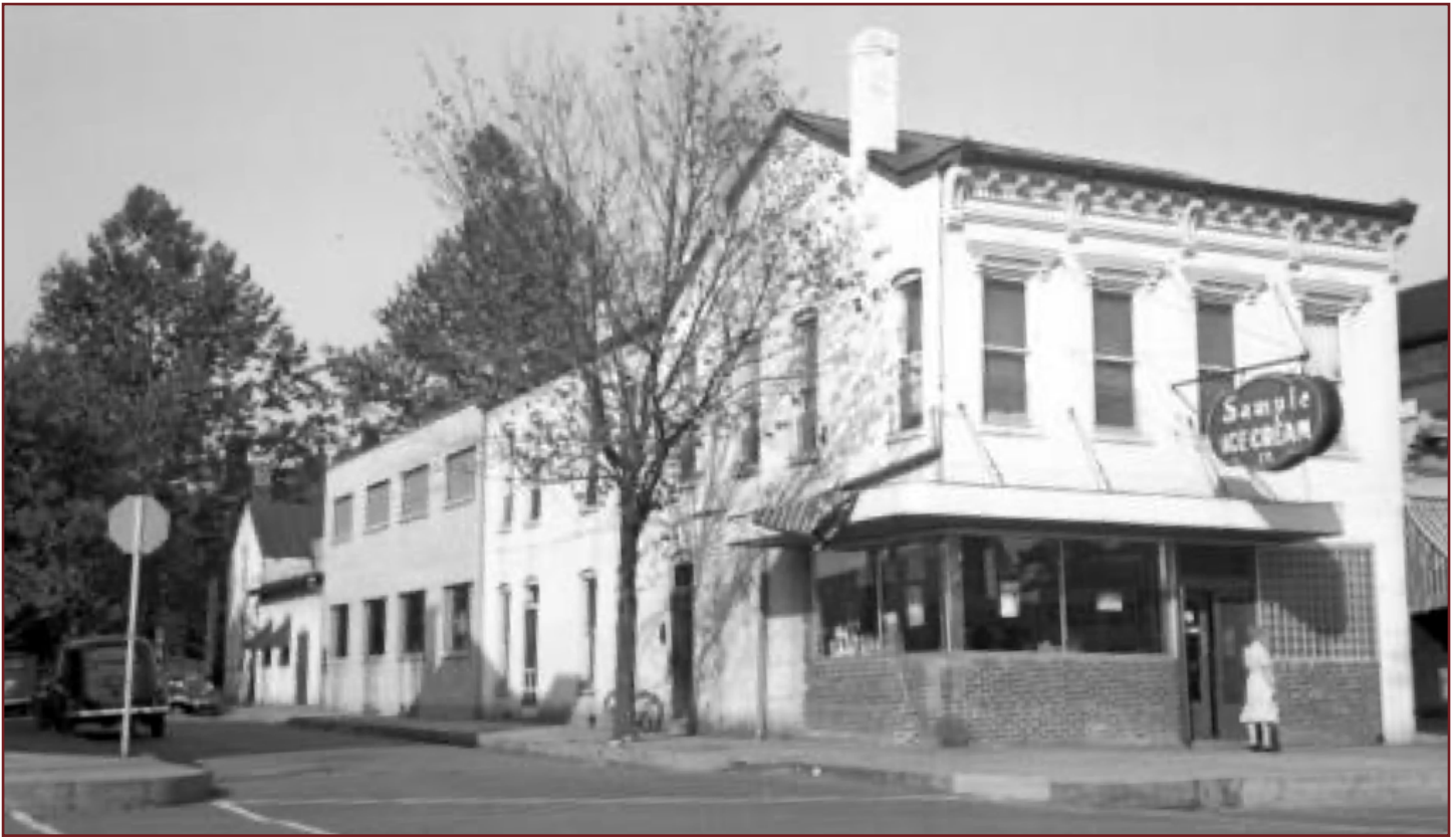
Sample's Ice Cream shop at the corner of Main and Poplar Streets in Madison. Picture taken 11-25-1945