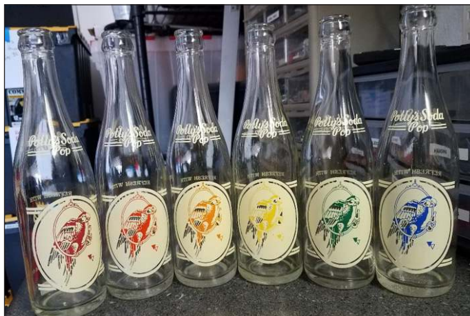
Parrot's Soda Pop bottle with the ACL in many colors