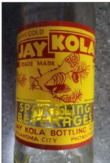
Jay-Kola with a Blue jay in the ACL label

My website is divided into the many genres of applied color labels. Some of my favorite sections include the "Birds and Bees" with nearly 100 unique bottles featuring our flying friends. Being a Florida kid, "Royal Palm" is another great section dedicated to this unique brand. "Planes, Trains, Automobiles" dedicated to the transportation era and another great favorite is "The Ladies Club"