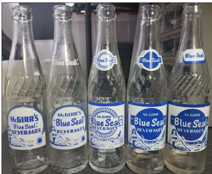
McGirr's Blue Seal Beverages, with a beach scene on the ACL

this passion has evolved to the creation of this website and my blog. My main message is to share my knowledge and research on the forgotten sodas of the past.