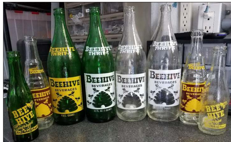
Beehive Beverages ACL's with different color bottles and printing