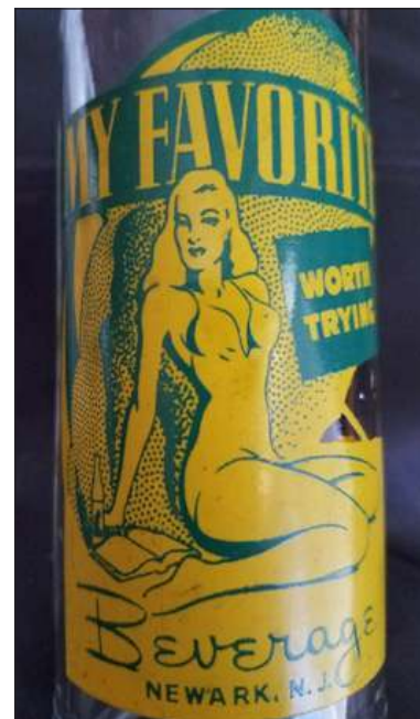
My favorite beverage bottle with beautiful artwork on the ACL

Well, the times have changed and those glass soda bottles are now only a memory. More a baseball card collector as a kid, my passion later grew into collecting vintage soda bottles most particularly applied color labels. Fast forward to today,