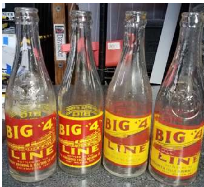
Big"4" Line ACL with a locomotive on the label

Watch each issue for a new installment of History's Corner.