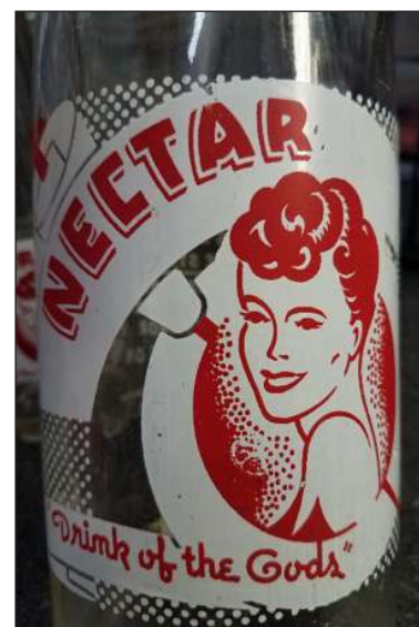
Nectar "Drink of the Gods" ACL bottle