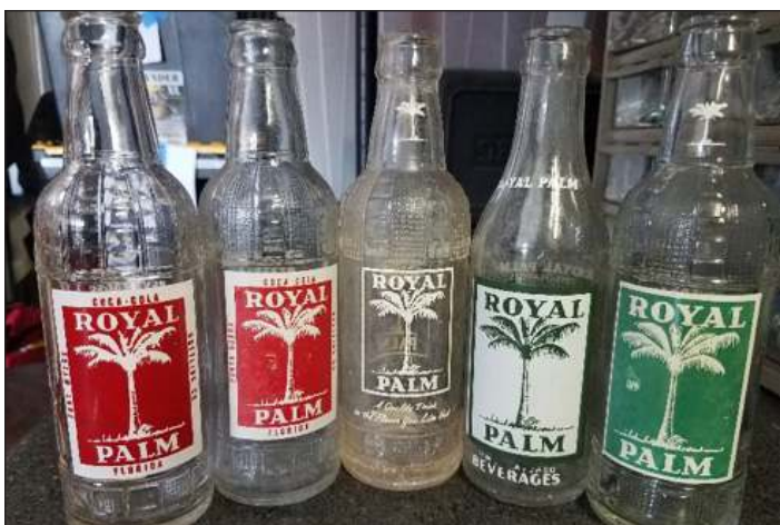
Coca-Cola's Royal Palm Brand with ACL color variations