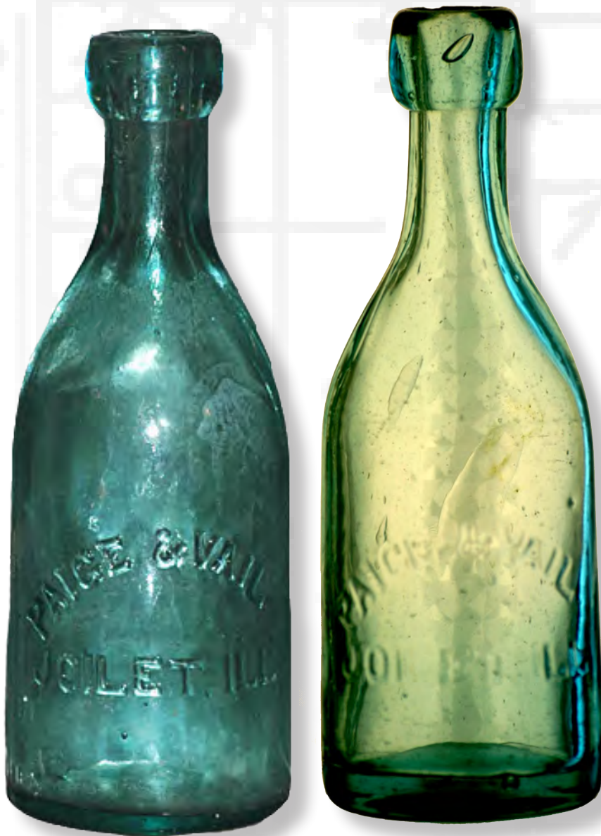
Two variants of the Paige & Vail bottles, on the left "JOIET", and "JOIET" on the right