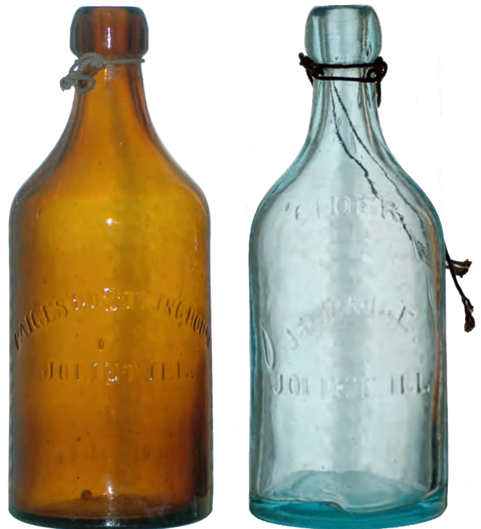
Paiges Ale and Cider bottles found in the basement in attic mint condition, still having the original tie string