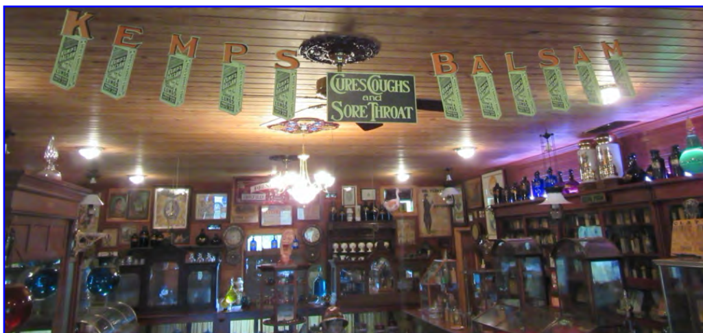
Jerry's museum consisted of three rooms, a pharmacy, a general store, and one devoted to advertising items. When you visit the archives in the future you will see the massive number of unusual items these walls contained. Wait to be amazed!