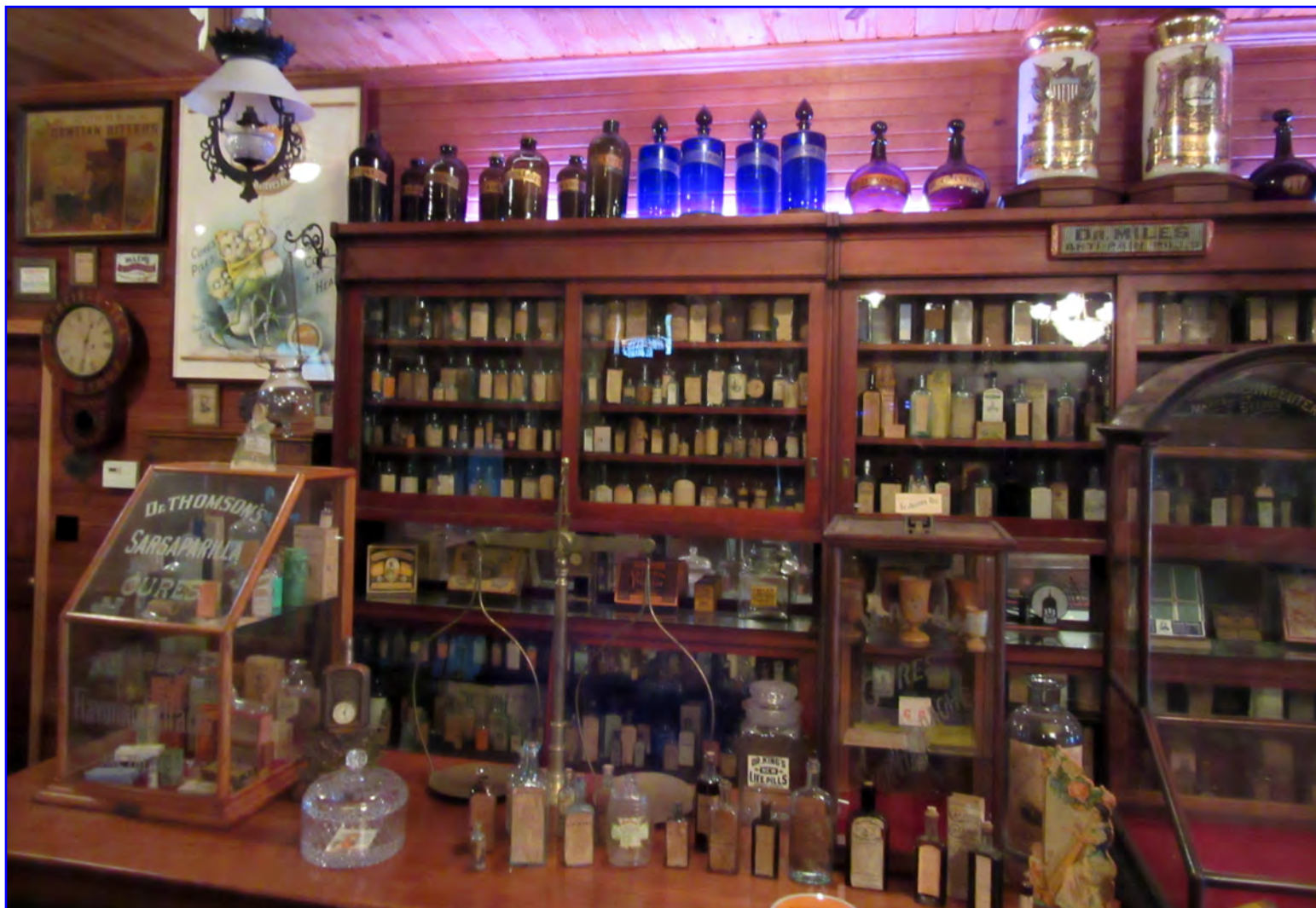
A look at what it was like to see behind the counter in the 1880s