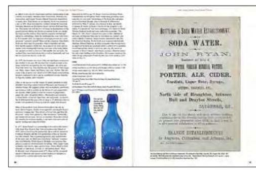
Example layout spreads within Early Georgia Sodas - The Bottles & Proprietors