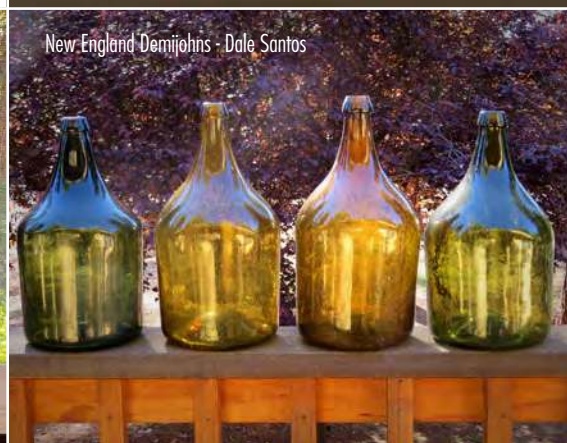
New England Demijohns - Dale Santos