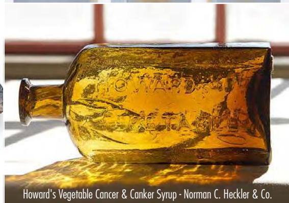
Howard's Vegetable Cancer & Canker Syrup