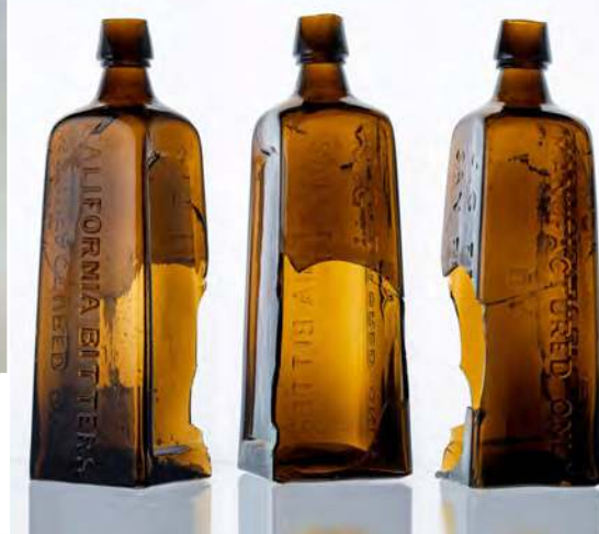
California Bitters (2nd known example)