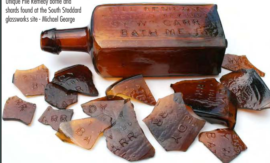
Unique Pile Remedy bottle and shards found at the South Stoddard glassworks site