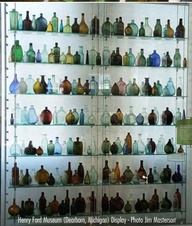
Henry Ford Museum (Dearborn, Michigan) Display