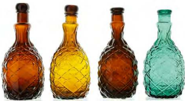
Figural Pineapples Bill Taylor Collection