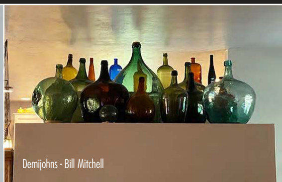
Demijohns