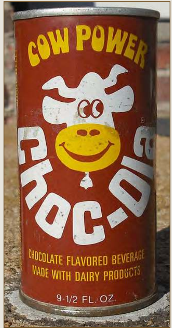
Cow Power Can from the 1970s