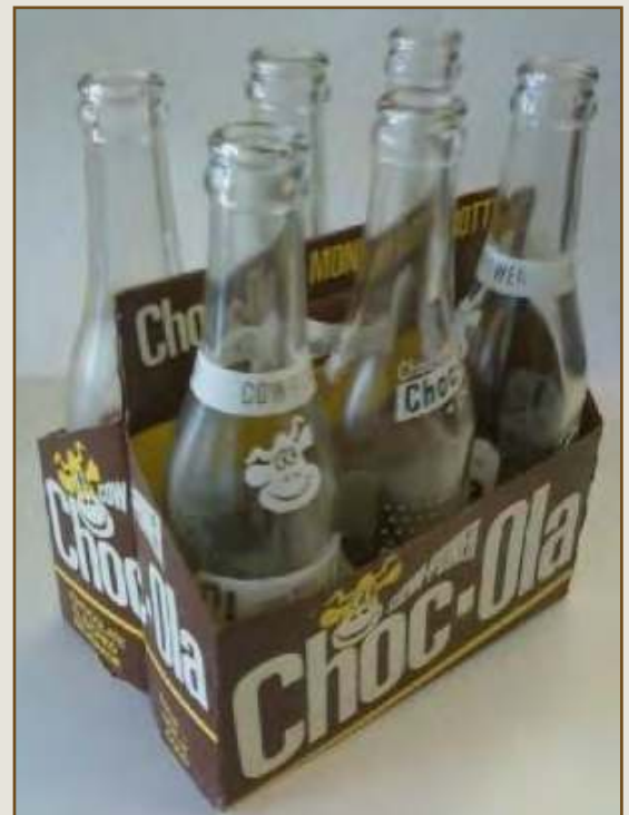
6 Pack of Choc-Ola from the 1960s