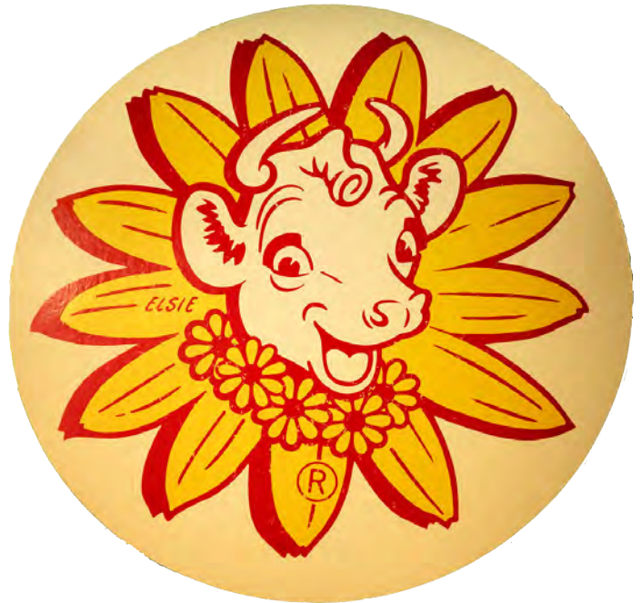
(Fig. 5) In 1936 Elsie the Cow became the Borden's company mascot

again in 1899, becoming Borden's Condensed Milk Company. In 1919, another name change was made, this time becoming the Borden Company.