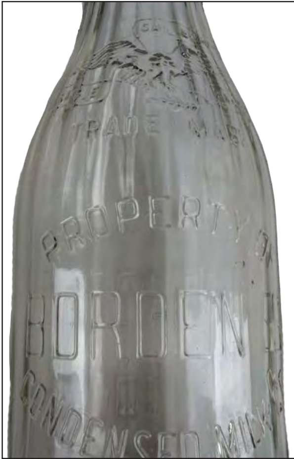
(Fig. 3A) Here is the early bottle with large name and eagle with its wing spread.

tions, both for the consuming and manufacturing markets.