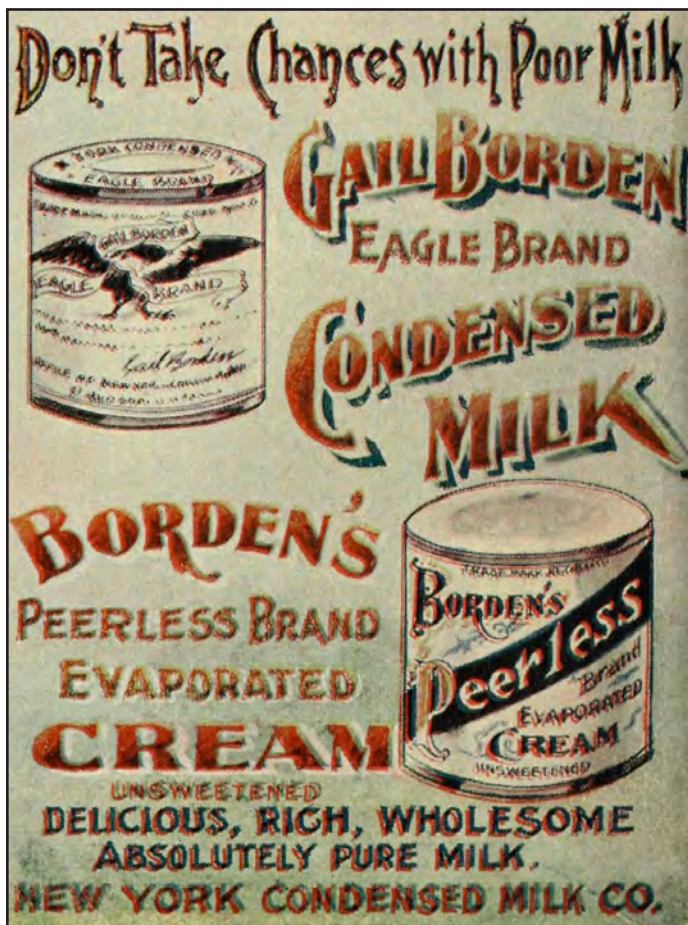
(Fig. 1A) Advertisement for Borden's Condensed Milk

Borden’s interests and occupations were many and varied before he entered the dairy business. Besides being a farmer, he spent various times as a riverman, a school teacher, a surveyor, a government official, a newspaper publisher and an inventor. Although Borden had a variety of occupations in his life, he nevertheless managed to achieve a degree of success in each of his endeavors - he helped lay out the city of Galveston, Texas; published the first permanent newspaper in Texas; and is believed to have coined the phrase “Remember the Alamo!” in a headline; sat on the councils out of which came the Republic of Texas as a government official; and patented numerous and assorted inven-