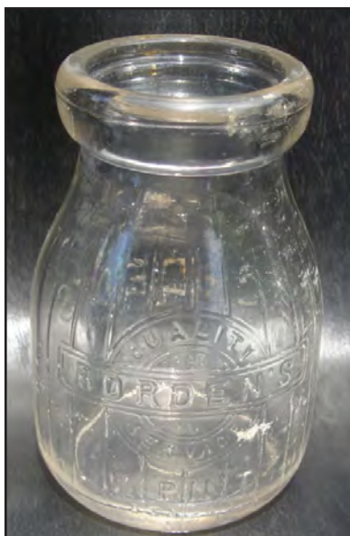
(Fig. 3B) Later Borden's Milk Bottle

The company's name and bottle embossments were changed