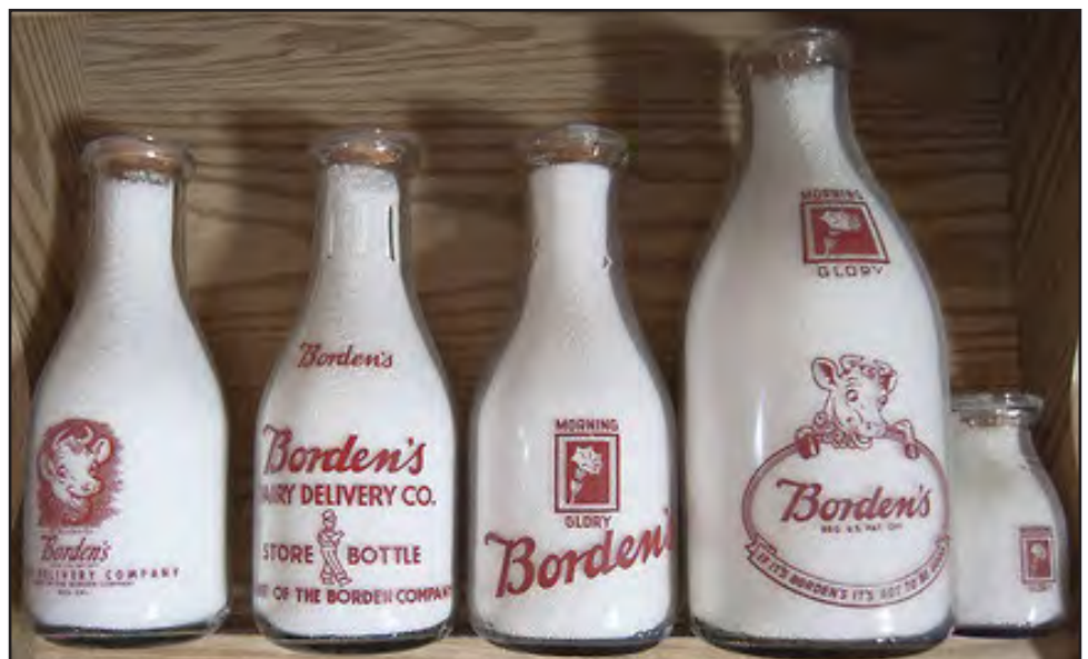
(Fig. 4) Applied Labels Borden's Milk bottles