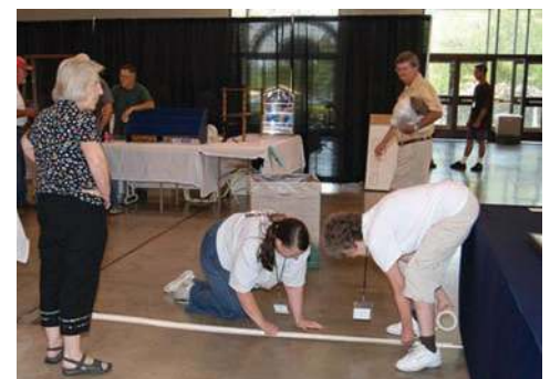
Pre-show (no comments allowed)