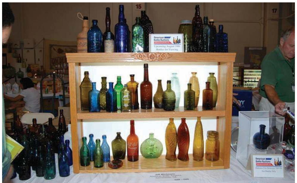
Jeff Wichmann's table