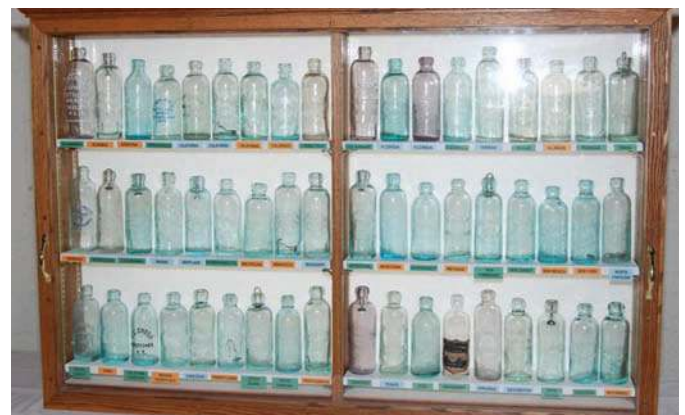
Dick Homme's 50 State Hutchinson collection