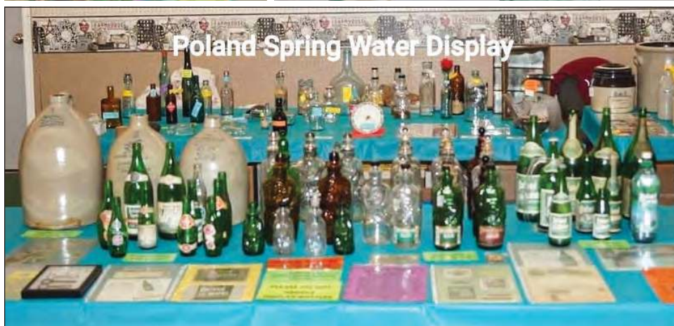
Poland Spring Water Display