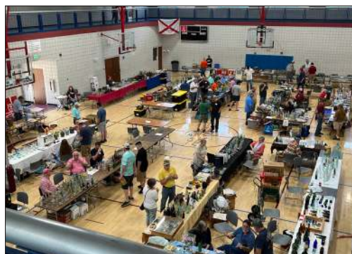
The Alabama Bottle & Antique Show held its 2nd annual event on May 14, 2022. More pictures at FOHBC.org.

Gardendale was a great host city and we are already working on next year's event.