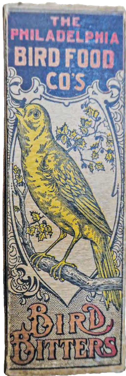
Bird Bitters original box

Plain common sense description of the symptoms of diseases of cage birds and