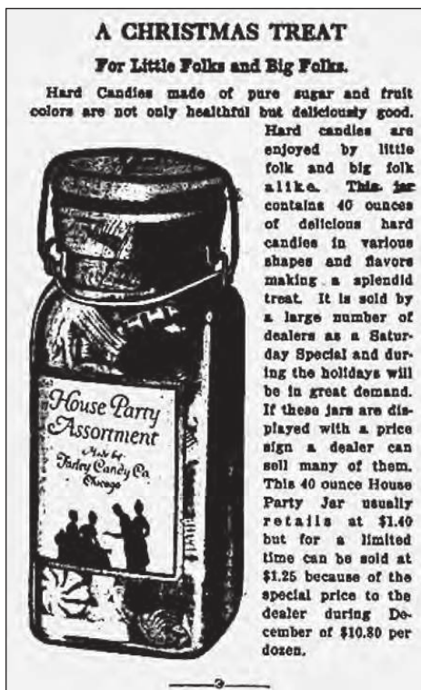
FIGURE C: House Party Assortment, December 1921 MEYER DRUGGIST.

Jars," at $3 per dozen. Although these little, round, screw cap, labeled jars look interesting, a 15 1/4" tall, painted tin for FARLEY'S TULIP BRAND CONFEC-