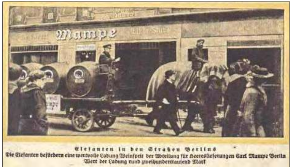
A Carl Mampe wagon being pulled by an elephant.