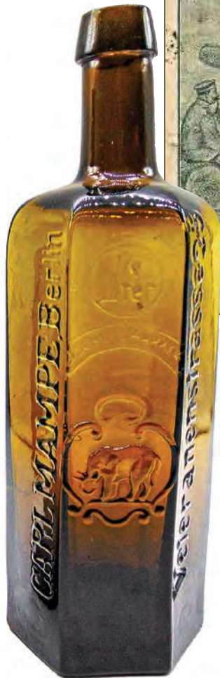
Lot of 2 bottles: Carl / Mampe / (motif of elephant) Berlin. Second bottle embossed Carl Mampe Berlin // Schutz Marke / (motif of elephant) // Veteranen Strasse 25. These early six-sided bottles are very rare.