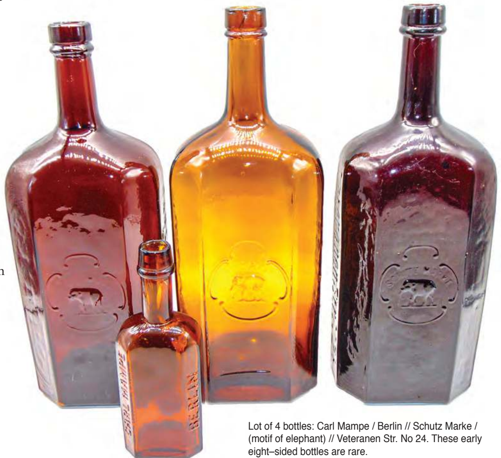
Lot of 4 bottles: Carl Mampe / Berlin // Schutz Marke / (motif of elephant) // Veteranen Str. No 24. These early eight-sided bottles are rare.