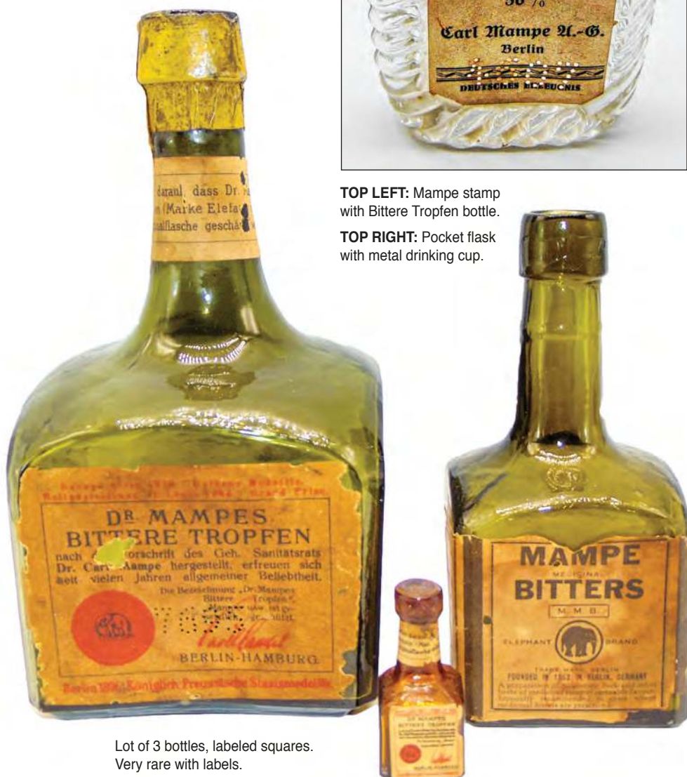
Lot of 3 bottles, labeled squares. Very rare with labels.