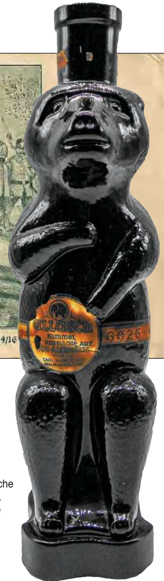
Kummel Bear with label. Allasch Kummel Russische Berlin S.W. 11 Germany. Figural bear bottle. Rare with label.

From the early days until its closure, the Mampe Co. was big on marketing its products. They donated two dwarf elephants, one named Carl and the other named Mampe, to the Berlin Zoo. The business seemed to always flourish, having many new products on the market. In the 1930s over seventy different varieties of Mampe products were served on Zeppelin flights. In the 1960s and 1970s they were big sponsors of auto racing.