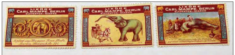
Carl Mampe Berlin elephant-themed stamps from 1910 to 1915.