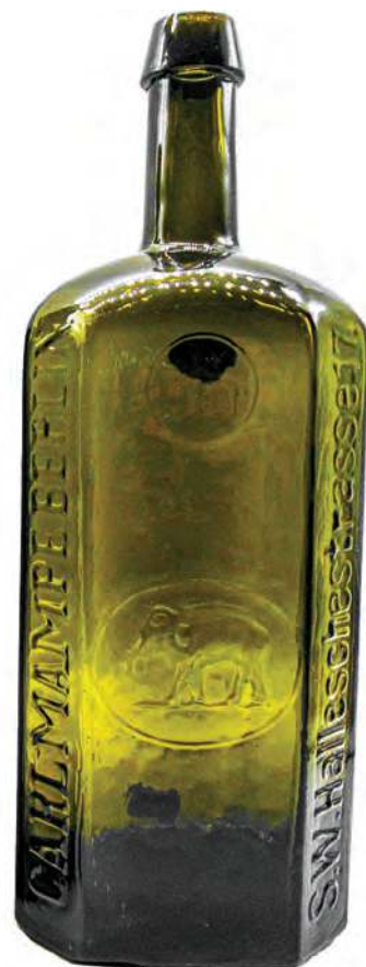
Lot of 2 bottles: Carl Mampe / Berlin // Elefanten / (motif of elephant) / Korn // S. W. Hallesche Strasse 17. Early eight-sided bottles, very rare. The second bottle is missing Elefanten and Korn.