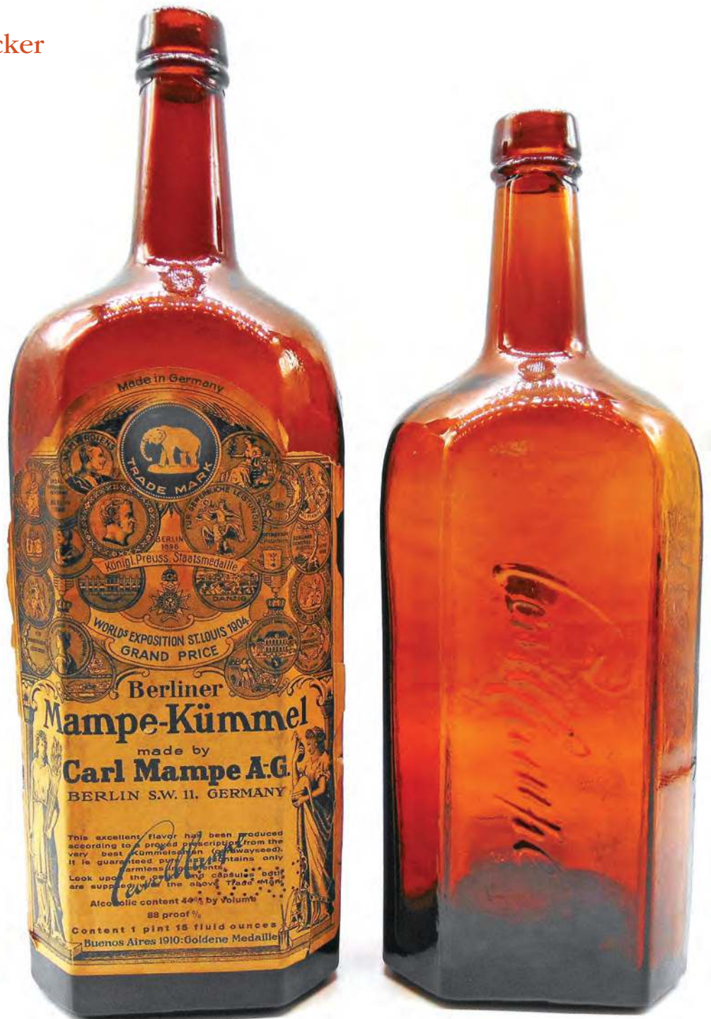
RIGHT: Lot of two Carl Mampe bottles. Elephant on base. Rare with label.