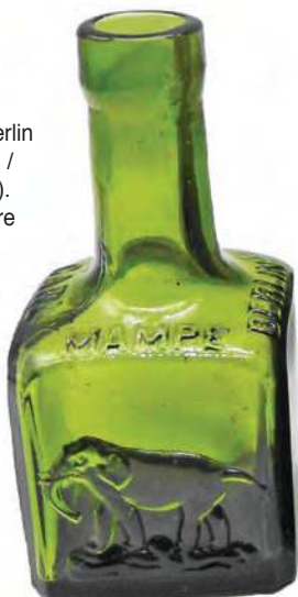
Lot of 2 bottles: Carl / Mampe / Berlin (around shoulder) / (motif of elephant). These early square bottles are rare.