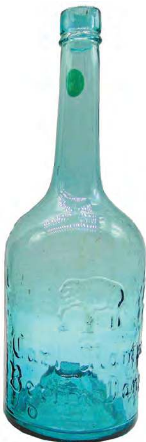
Lot of 2 bottles: (motif of elephant) Carl Mampe / Berlin – Danzig. Round-style bottle. Scarce to rare depending on color.