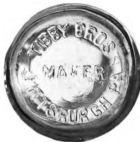
Tibby Bros - Maker - Pittsburgh PA embossed on base of milk bottle.

Given that the Tibby Brothers were in business for a considerable length of time and operated numerous furnaces with dozens of pots at several factories, it is interesting that they marked very few of their wares. Given the highly competitive nature of the glass industry during the period that they were in business, you would have thought that they would have wanted every advantage that they could get, including the advertising of their wares at essentially no cost.