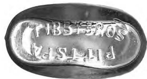
Base of Tibby Bros Lettered Flask.