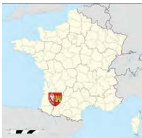
PHOTO A: Agen, a commune in the Aquitaine, an historic region in southwestern France, whose capitol is Bordeaux.

Prunes d'Ente has been a celebrated product of the Agen at least as far back as the 1500s, has been protected by the European Union since 2002, and is a sweet, tasty delicacy.