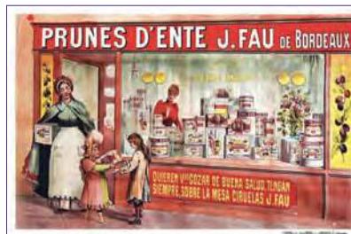
PHOTO JF2: PRUNES D'ENTE J. Fau de Bordeaux Trade Mark advertising trade card. Notice the boxes in the window and the little girl's hand with the prune jar printed on the box.