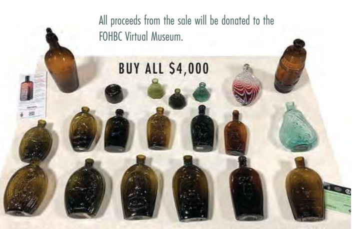
ALL PROCEEDS GO TO THE FOHBC VIRTUAL MUSEUM