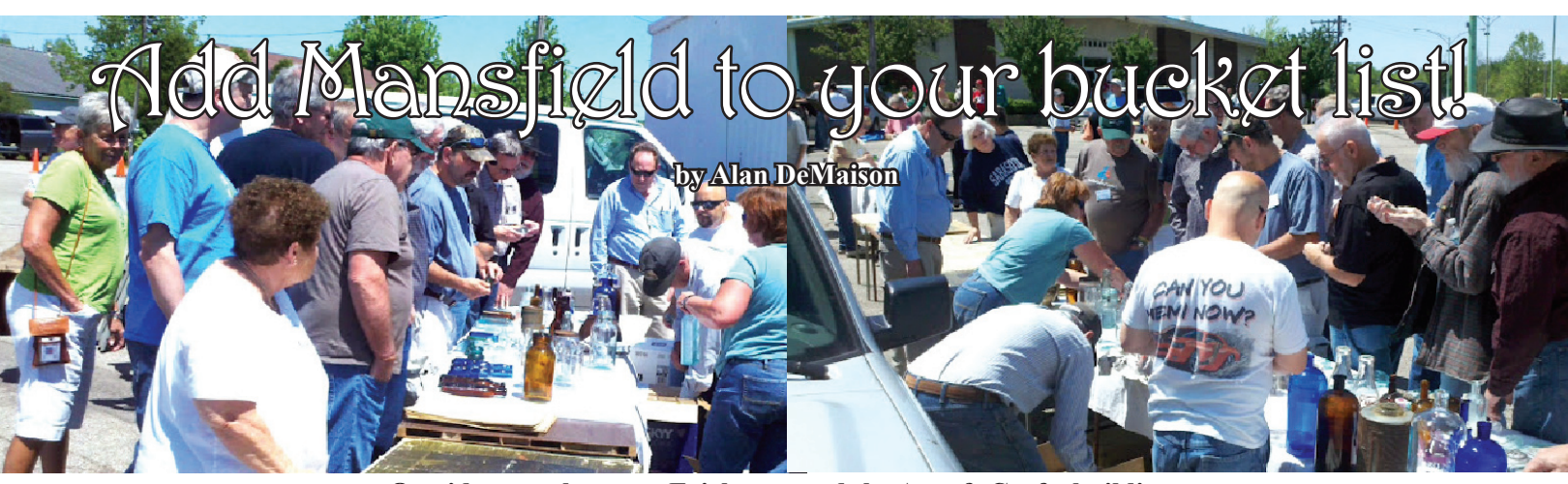
Outside setup between Fairhaven and the Arts & Crafts buildings

The 2012 edition of the Mansfield Antique Bottle Show and Sale is history. A beautiful Mother's Day weekend greeted the many bottle collectors on Friday, May 11th, and Saturday, May 12th. Friday was dealer setup and early admission, followed by the famous Ohio Bottle Club dinner at 6:20.