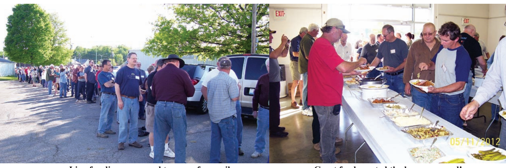
Line for dinner, seemed to go on for a mile