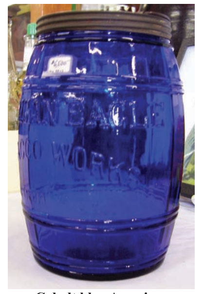
Cobalt blue American Eagle Tobacco Works