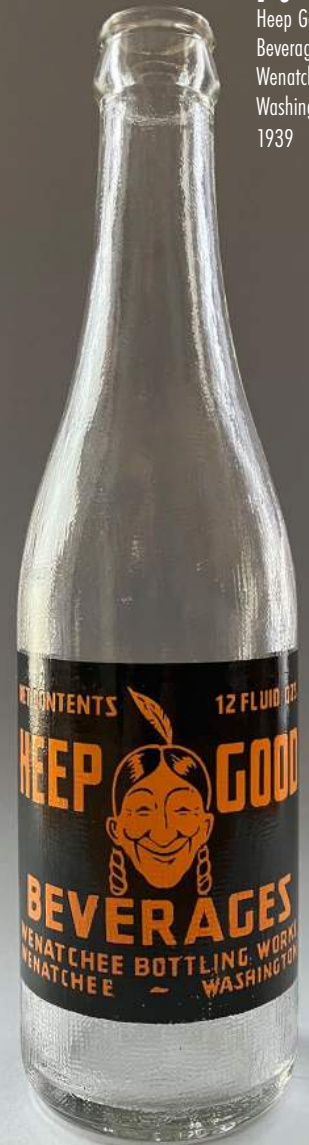
[Fig. 5] Heep Good Beverages, Wenatchee, Washington, 1939