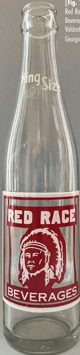
[Fig. 2] Red Race Beverages, Valdosta, Georgia, 1946