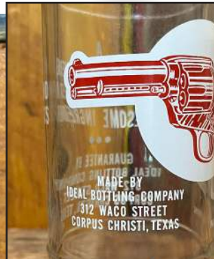
[Fig. 6] Big Giant (45), Corpus Christi, Texas, 1963. The bottle is one of the few ACL sodas with “Patent Pending” but, if a patent was granted, why do so few bottles exist?