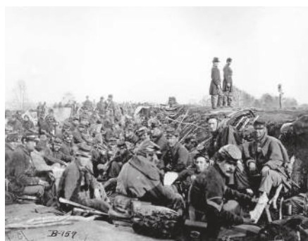
Confederate soldiers and officers mustered in their trench, Petersburg, Virginia, 1864.

“Lee Quality Beverages” was put up in 1956 by the Lee Beverage Company of Petersburg, Virginia, and contained ten fluid ounces. The ACL depicts Confederate battle flags flying above the name with little stars throughout. (Fig. 3) Petersburg is the home of U.S. Army Fort Lee, named after Confederate General Robert E. Lee. The label evokes a contemporary controversy: the removal of Confederate statues, flags and other symbols from public spaces. Recently, on April 27, 2023, Fort Lee itself was renamed Fort Gregg-Adams in honor of two renowned black Army officers. Petersburg was the object of a siege during the Civil War, which lasted more than nine months and resulted in an astoundingly sad number of casualties, approximately 42,000 men on the Union side and 28,000 on the Confederate side. The siege is said to be the first battle to have involved trench warfare. In addition to the U.S. Army garrison, Petersburg is the site of a National Battlefield memorializing both sides’ patriotism, bravery, and sacrifice during the Civil War. “Lee Quality Beverages” is fairly available to collectors but always in demand.