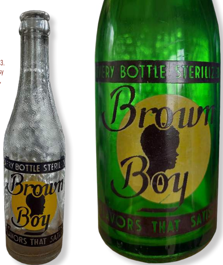
[Fig. 4] Brown Boy, Atlanta, Georgia, 1953.

[E] Fan displaying Chief Wahoo, mascot of the Cleveland Indians until 2018 when the team eliminated him.