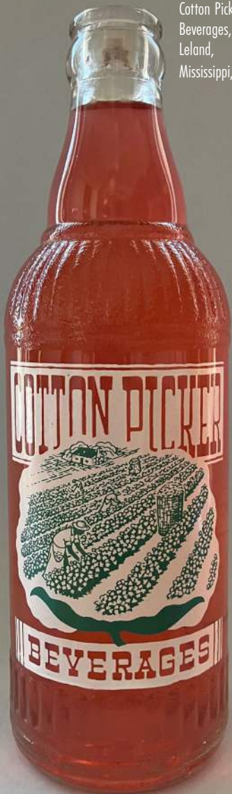
[Fig. 1] Cotton Picker Beverages, Leland, Mississippi, 1949