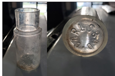
photo in the book describes it as "a Bohemian-imported laxative of strudel salts introduced in 1863." The near identical base embossing are unlikely coincidental and since the salt bottles have a clear New York connection I would feel much more confident they are of same import and have no connection to California. Attached are photos of mine for comparison to the pics in the story...

ent, laxative, diuretic, accelerates absorption, stimulates nutrition, aids digestion, corrects acidity. Eisner & Mendelson Co. Sole agents for the US. 6 Barclay Street, New York City. Introduced in 1863." The labeled